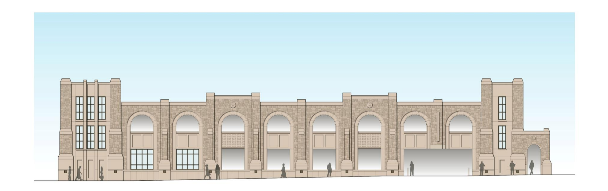
10^{\mathrm{TH}} STREET ELEVATION