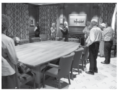
George A. Rentschler Room, American Heritage Center.