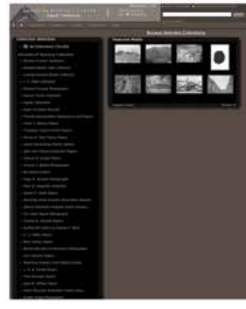
Digital Collections Web site, at http://digitalcollections.uwyo.edu/luna

uwyo.edu) receives over 60,000 visitors annually and contains information on its faculty, its policies, its public programs, its exhibits, its grants, its publications, and most importantly, its collections. The AHC has also provided national leadership in the area of digitization, including "mass digitization," speeding the process of creating