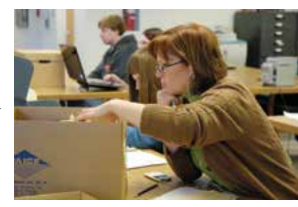
Researchers in the Owen Wister Western Writers Reading Room.

students, and members of the public on an equal basis. The professional archivists and librarians at the AHC provide bibliographic instruction to dozens of UW