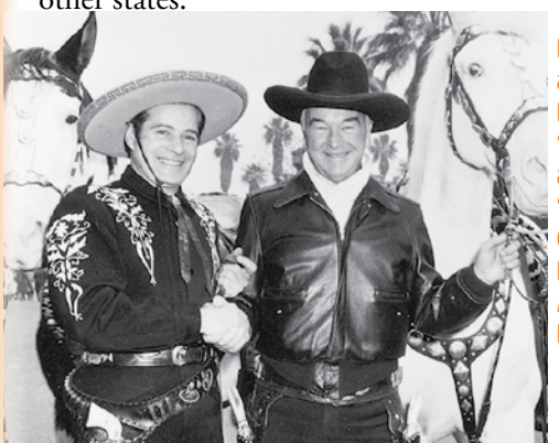
Popular Western film and television stars Duncan Renaldo, "The Cisco Kid," and William Boyd, "Hopalong Cassidy."

Also in the Loggia visitors will find on display original saddles used by Hopalong Cassidy (William Boyd) and the Cisco Kid (Duncan Renaldo), as well as a rotating selection of books from the Toppan Library. Other, smaller, displays introduce visitors to the wide variety of archival collection material held by the AHC and available to the public for research on the 4th Floor in the Owen Wister Western Writers Reading Room. The AHC also has a number of traveling exhibits available to museums, libraries, and other institutions. Minimal charges are assessed for insuring and shipping these exhibits. More than 35,000 visitors each year view the AHC's traveling exhibits throughout Wyoming and occasionally in other states.