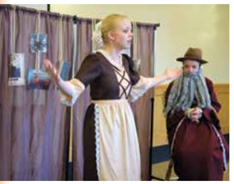
Wyoming History Day students' performance, 2011.

region. The institute also conducts related oral history projects and presents a variety of public programming.