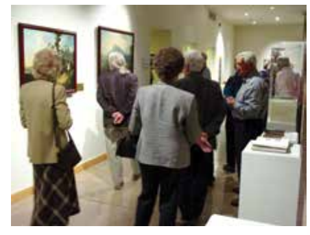
Visitors viewing Alfred Jacob Miller paintings in the Centennial Complex Loggia.

The AHC is not a museum, but the circumstances of its history have resulted in the premier collection of Western art at UW being on permanent display in the