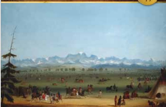
The Rendezvous Near Green River-Oregon 1837 (General View of the Indian Camp). Alfred Jacob Miller.