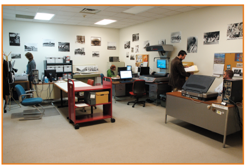
AHC state-of-the-art scan lab.

the Abner Luman Reliquary that include the Wyoming History Day headquarters and the AHC's Digital Programs department. Visits to either office can be arranged easily, often the same day by calling down from the Information Desk (2<sup>nd</sup> floor).