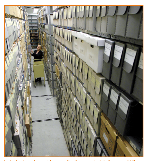
A student worker retrieves collections materials from an AHC storage room.