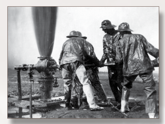
Workers capping an oil well.