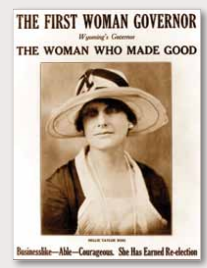
Reelection campaign poster for the first woman governor in the United States, Wyoming Governor Nellie Tayloe Ross, 1926. Nellie Tayloe Ross Papers.