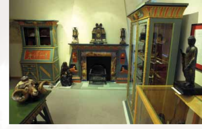
The Colket Room, adjacent to the Toppan Rare Books Library, American Heritage Center.