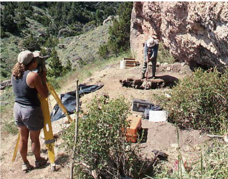
Excavations at BA Cave in 2005.

This year marks the 16 th season of investigations at BA cave. We continue to recover a rich chipped stone and faunal assemblage at the site. Last season after the removal of Early Archaic age rockfall we discovered significant quantities of large animal remains, still in the Early Archaic component. The rockfall had been an impediment to excavation for several seasons, and now that it is removed we will be able to investigate deeper strata. On the basis of diagnostic artifacts discovered during the initial investigations in 1994, we suspect that Paleoindian components lie below the Early Archaic ones. We hope to confirm this early occupation of the shelter during the upcoming season.