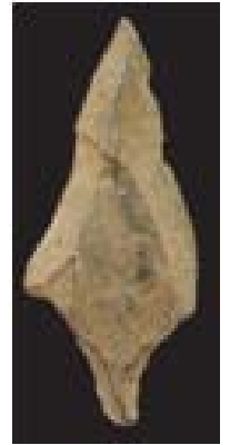
Late Upper Paleolithic Suyanggae projectile point.

The importance of the site to Korean and East Asian prehistory was recognized by the development and construction of a world class museum at Suyanggae for preservation and study of Korean prehistory. In addition to Suyanggae's importance to East Asian prehistory, the site is potentially significant to discussion of peopling of the Americas. Suyanggae is one of a number of late