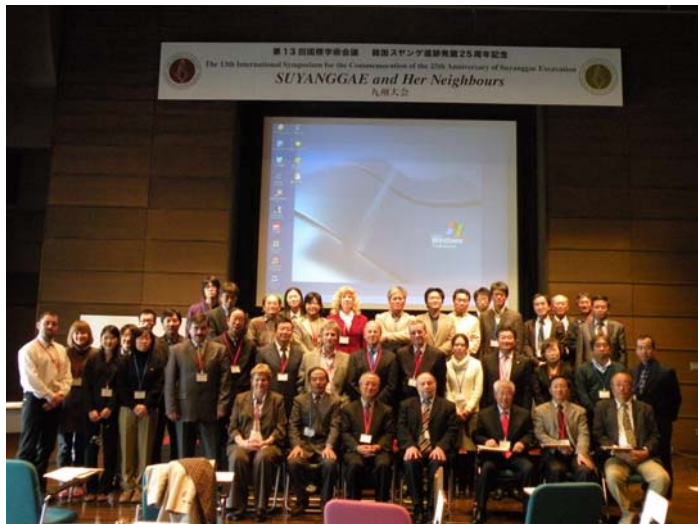
Participants of the 13th Suyanggae symposium at Saitobaru Archaeological Museum.