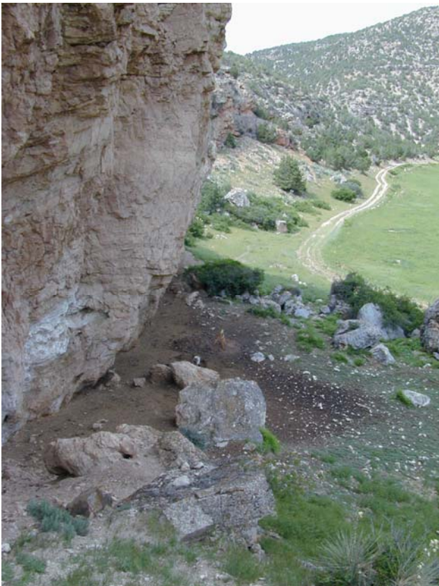
Alm Shelter at the mouth of Paint Rock Creek.