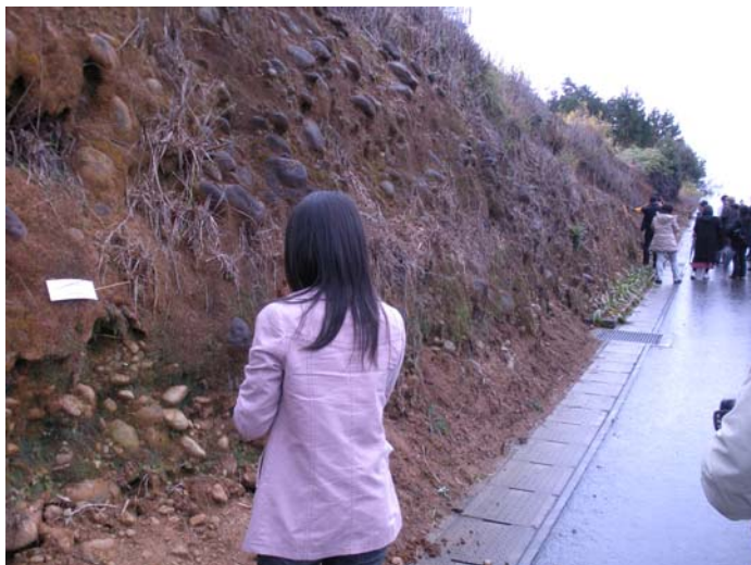
Visit to Ushiomata Site following the Suyanggae Symposium.