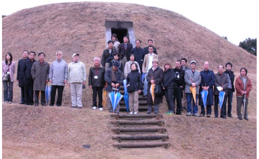
Post-conference tour of Saitobaru mounds, the largest approximately 6th century AD Kofun Period burial complex in Japan.

American populations. Late Upper Paleolithic and post-Last Glacial Maximum sites are continually undergoing excavation, new ones are being discovered, and old collections continue to yield new data. The possibilities of cooperation in this research area are endless. And currently we are working on at least one joint paper on this topic with Russian colleagues.