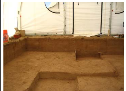
An excavation inside a Weatherport.