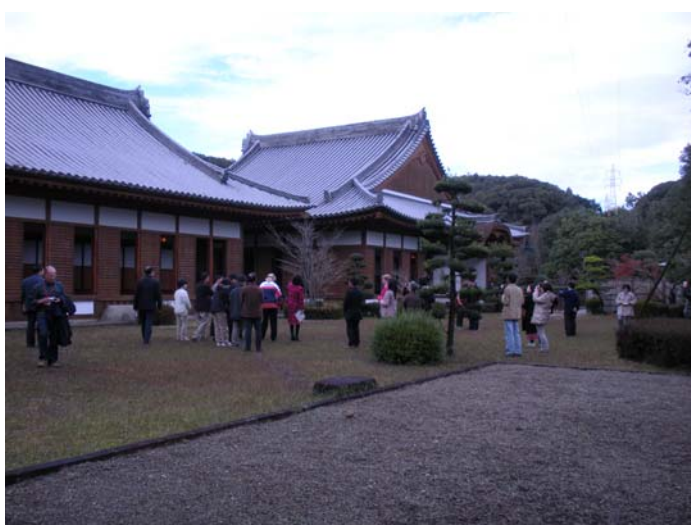
Visit to Sadawara Castle following the Suyanggae Symposium.