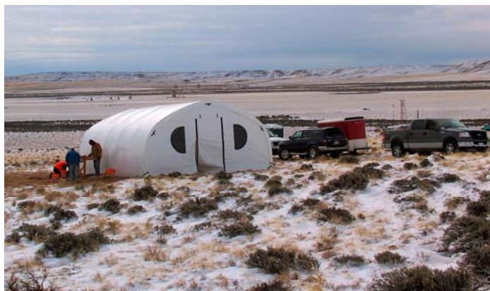
The Institute's new weatherport.

The metal frame Weatherports donated by Metcalf Consultants are of two sizes, one is 20' x 20' (6 x 6 m) and the other is 20' x 25' (6 x 8 m). Thus each can accommodate an excavation block of significant size. The metal frames are covered with heavy duty, vinylized covers that can withstand various harsh weather conditions of the Rocky Mountain region. These sturdy structures are designed for year round use. The Weatherports significantly improve the Institute's field capabilities.