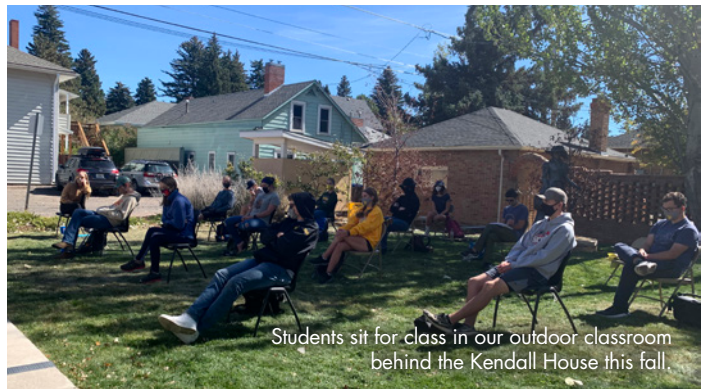
Students sit for class in our outdoor classroom behind the Kendall House this fall.

Amid the ongoing pandemic, this fall Haub School faculty and staff tapped into their creativity and expertise in field-based and outdoor education to create a safe and effective outdoor "classroom" in the backyard of the Bim Kendall House. First-year students in ENR 1101, Thinking Like a Mountain , and graduate students in ENR 5000, Approaches to ENR Problem-Solving , utilized the space for discussion, guest lectures, and active learning experiences throughout the in-person phases of the fall semester. Using basic materials like a portable whiteboard, wireless microphone and speaker, and projector (for evening screenings of films like Deer 139 ), students had the opportunity to learn in a collaborative, face-to-face setting—always wearing our masks, keeping physical distance, and sanitizing shared surfaces—with the added layer of COVID-19 safety that comes with learning outdoors.