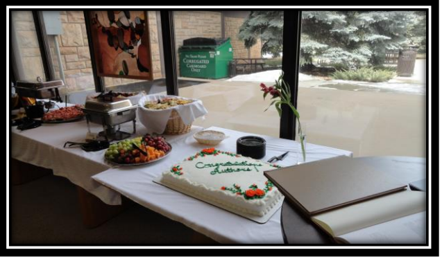
Reception to Celebrate Faculty & Student Authors