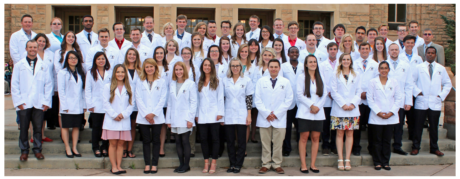
The School of Pharmacy welcomed the class of 2021 in a white coat ceremony on August 24th.