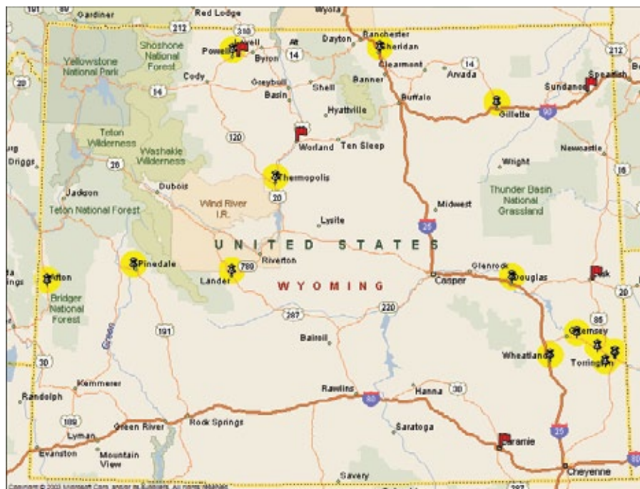
Figure 1. Schematic representation of High Tunnel workshop locations. Yellow pushpins = completed workshops and high tunnel locations in 2010; red flags = scheduled and proposed workshop sites for 2011.

An economical, easy to construct, and durable high tunnel/hoop house with the potential to increase crop diversity and local food production are top-of-mind areas of interest for food producers in Wyoming. Public participation in the workshops and seminars exceeded expectations. This project encourages hands-on learning and the opportunity to discuss unexplored methods of crop diversity and production. The possibility of building a low-cost high tunnel that provides protection against Wyoming's