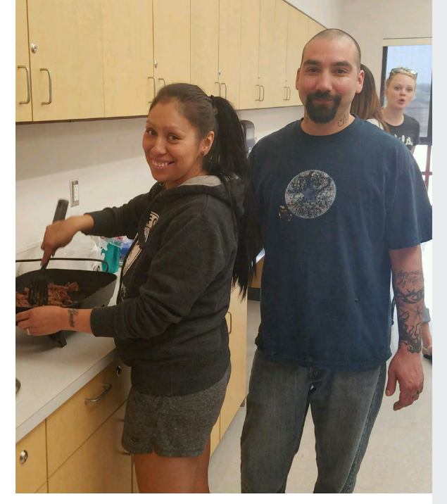
"Thank you so much for the class. It made me think twice about food. I found fast and easy ways to cook, which, with my family, saves me a lot."