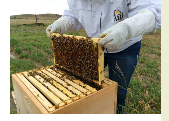
In Wyoming, 66,136 hives are registered for 5,470 bee yards, which includes hobbyist and backyard beekeepers, according to the Wyoming Department of Agriculture Technical Services Division.

Hive losses occur for complex reasons, from bee starvation to parasites and diseases, but hobby and backyard beekeepers take the highest losses, says Wissner.