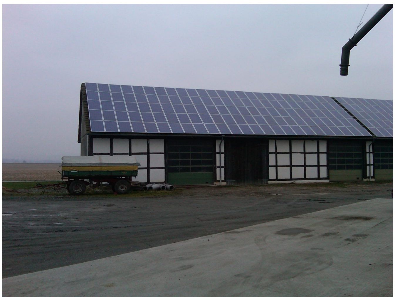
This was a commonly observed contrast between old and new. Solar panels have been installed on a building that was build in the 1700s.