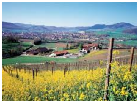
Research Institute of Organic Agriculture (FiBL, Switzerland)

The Swiss Research Institute of Organic Agriculture was constituted as a private foundation by organic farmers, scientists and politicians in 1973. It has established practice-oriented agronomic, ecological, veterinary medicine and economic research, and is making new findings available to the organic farmers in Switzerland and abroad. On-farm research is carried out within a network of about 200 pilot farms. Today, the institute has more than one hundred scientific and technical employees and has world-wide recognition as a competence centre for organic research, advice, development cooperation and documentation. In 2001 FiBL Berlin was founded. FiBL participates in several EU funded projects.