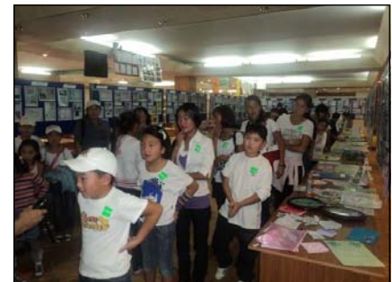
Exhibits created by the members in the 4-H Summer Reading Program.

The awards program was broadcast nationally through Mongolian T.V. This T.V. station is also interested in broadcasting