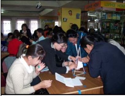
Librarians participating in an activity to demonstrate the experiential learning process of “do, reflect and apply”.

Training on experiential learning included outlining the process of “do, reflect and apply” which is part of the hands on experience 4-H members get when they complete their project work. Each training also included a hands on experience to demonstrate how the experiential learning process can be used to