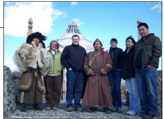
Our Mongolian hosts coordinated a trip to visit the Ancient Cities. We are standing in front of the Outpost City which was used as a first line of defense to protect the interior King's City and as a mail delivery center.

A special thank you to the Global Perspectives program at the UW College of Agriculture, the Wyoming State 4-H Office, Wyoming 4-H Foundation, the International 4-H Youth Exchange (IFYE) Alumni Association and the U.S. Embassy in Mongolia for funding to make this training possible. Thanks also to all the staff and volunteers at the Mongolian 4-H Youth Organization who were such gracious hosts and made our trip so enjoyable.