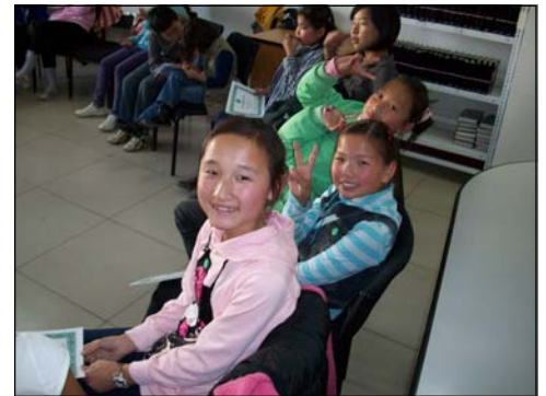
Mongolian 4-H members anxious to become e-mail pen pals with Wyoming 4-H members.

bassy has also provided grants to support the Mongolian 4-H Youth Organization, as well as lodging during our training.