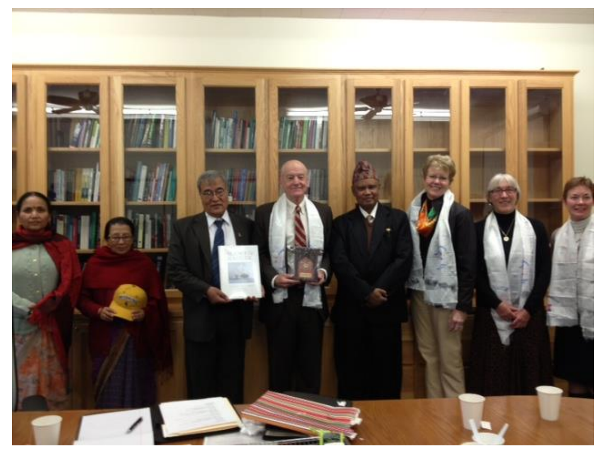
Figure 2. Officials from University of Wyoming and Tribhuvan University at the Memorandum of Understanding Ceremony in Old Main.