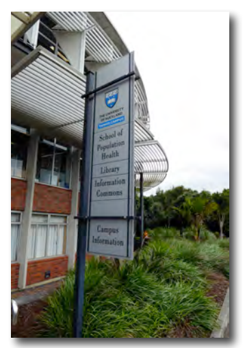
Figure 1: Outside University of Auckland's School of Public Health in April 2016

Recent research findings reveal genes play a smaller role in determining life outcomes than once thought. In the classic, nature versus nurture debate, scientists find neither nature nor nurture can be understood in isolation. Environmental, social, and cultural measures need to be examined to understand not only how genes influence development, but how life experiences influence gene expression. Without a doubt, family economic status is one of the one of the primary factors determining our early life experience. It determines many of our opportunities and choices, big (e.g, housing and education) and small (e.g., dinner tonight). Family's navigation of these choices depends, in part, on their economic behavior and decision-making processes. These, in turn, are influenced by social and cultural experiences, family composition, and personal preferences. Consequently, a mixture factors play determine a child health and development.