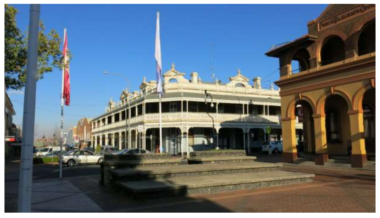
Early morning street scene, Armidale, NSW.