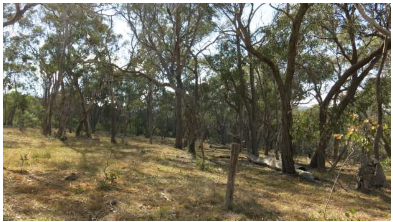
Australian bush, tablelands region near Armidale, NSW.