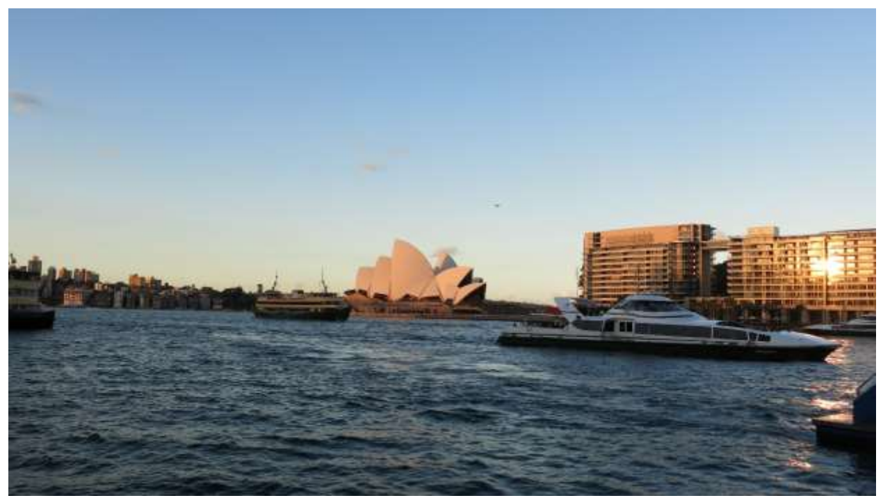
Winter sunset on Sydney harbor and the Circular Quay.