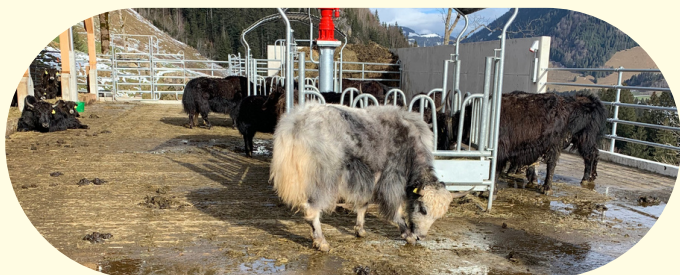
Photo of Yak during a farm visit with BBZN staff