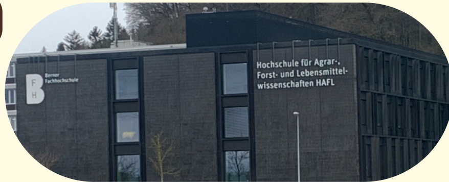
Photo of the Bern University of Applied Sciences