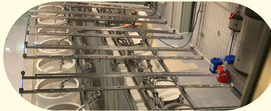
Photo of inside the Gruyere Cheese Factory