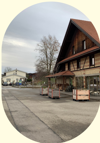
Photos from Burgrain store and outside of event hall