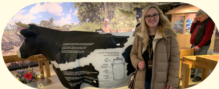
Top and Bottom Photos from the Cailler Chocolate Factory