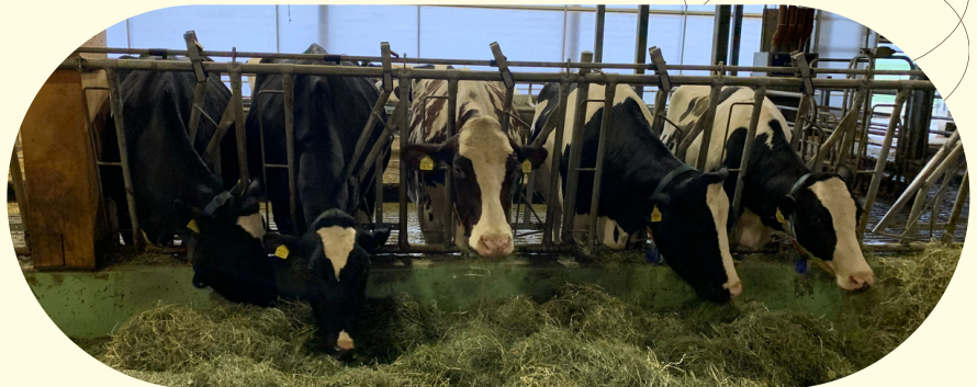
Photo of dairy cows at the Grangeneuve Extension Center