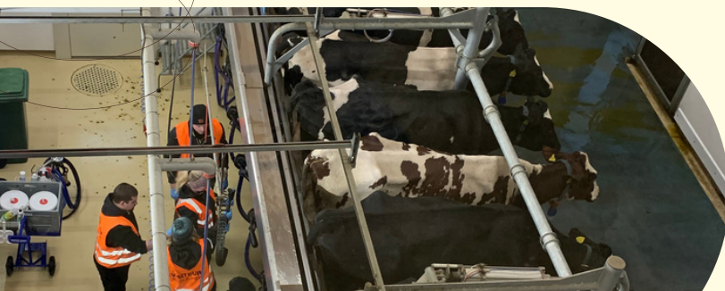
Photo of students learning about dairy farming at the Grangeneuve Extension Center