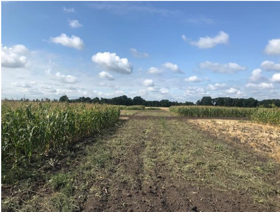
Photo 7: 100-year old experiment comparing continuous corn with corn/cover crop/winter wheat rotation.