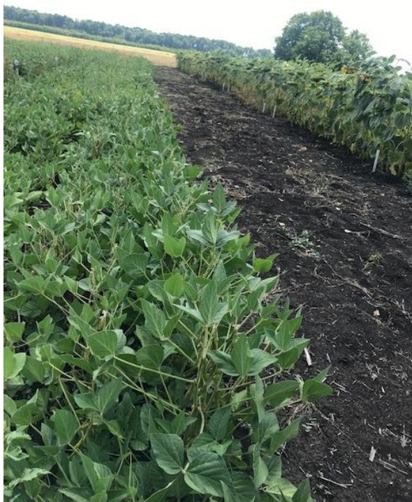
Photo 4: Soybean/winter wheat (already harvested)/sunflower rotation.