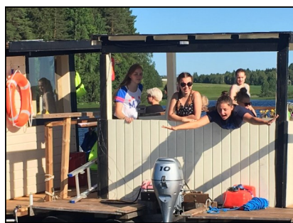
A water tour on Vieremä's famous sauna boat. Combining Finland's vast lakes and river ways with a favorite cultural activity—Sauna!