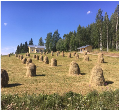
The finished product - traditional Finnish hay stacks dot the hay field.

could view and learn about different livestock species such as dairy goats, wool sheep, meat rabbits, driving ponies, and laying and market duck. 4-H members cared for the animals and lead educational tours for visitors. In addition, the 4-H members set up educational booths and games at local horse race track. The goal was to teach young people about the local agriculture industries and explore career opportunities in the many agriculture fields.