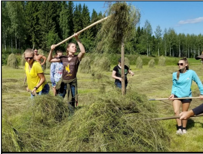
American and Finnish students participate in the traditional hay stacking method to dry hay.

The Finnish 4-H Federation primarily supports youth education and youth development through 3 main program areas: