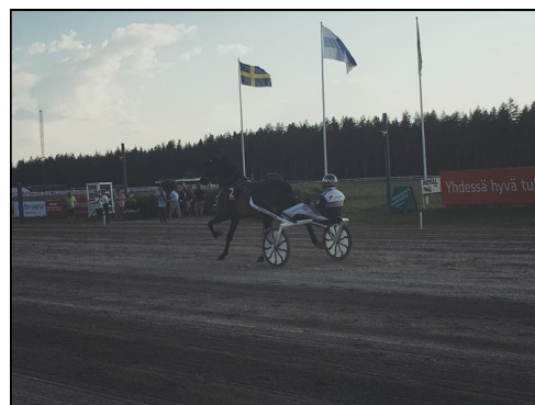
Participants took in the very popular Friday night horse races.