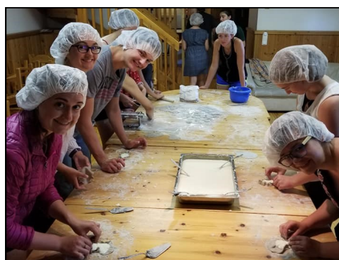
Making traditional Finnish rice cakes—Piirakat (Karelian pie)

While in Finland, American visitors had the opportunity to learn about the rich Finnish history and culture. This provided an opportunity to explore cultural experiences such as traditional Finnish foods, Nordic architecture, Finnish saunas, and the traditional Finnish way of life.