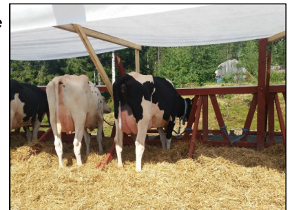
Participants visit Finnish dairy farm and explore the Dairy Research Field Days.