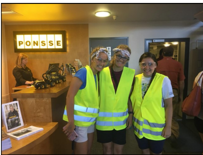
Visit and tour of Finland's largest forest machine manufacturer, Ponsse. Forest products are one of Finland's largest and most important agriculture industry.