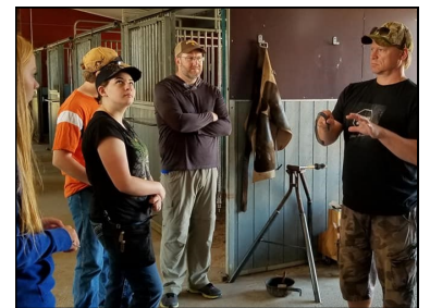
American and Finnish students visit horse stables and learn about the Finnish horse industry.

and youth members of the Vieremä 4-H Association.