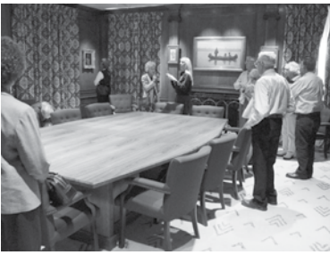
George A. Rentschler Room, American Heritage Center.