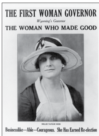
1926 campaign brochure cover from the Nellie Tayloe Ross Papers, American Heritage Center.

AHC also offers grants to UW teaching faculty, to develop new courses the make significant use of that repository's holdings.