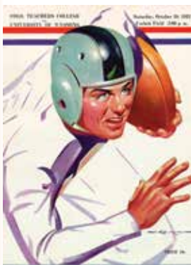
University of Wyoming Football program cover, 1942.