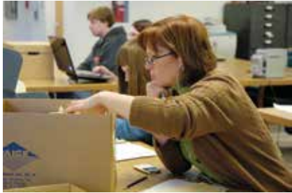
Researchers in the Owen Wister Western Writers Reading Room.

The professional archivists and librarians at the AHC provide bibliographic instruction to dozens of UW