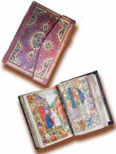
Cover of an 18th-century illuminated Koran and pages inside a 15th-century illuminated Book of Hours from the collections of the Toppan Library.

books collection, consisting of more than 55,000 items. More than 1,300 people visit Toppan in a typical year, and its curator gives almost 40 special-topic presentations to UW classes and other groups. Unlike most rare book libraries, it is an active teaching site.