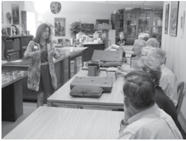
Toppan Rare Books Library, American Heritage Center.

and Wyoming historian—began collecting the papers and reminiscences of Wyoming’s pioneers. In 1945 her research on