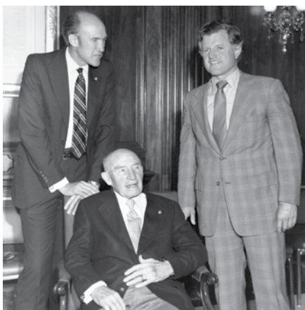
Wyoming U.S. Senator Alan K. Simpson (left), his father and former U.S. Senator Milward Simpson (center), and U.S. Senator Ted Kennedy (right), 1979. Kennedy was a close friend to both Simpsons.

The Simpson Institute focuses on the acquisition, preservation, and research use of the papers of prominent individuals, institutions, and organizations that have provided leadership—political, economic, social, and cultural—for Wyoming and the region. The institute also conducts related oral history projects and presents a variety of public programming.