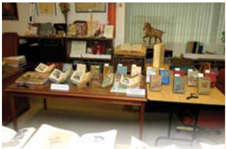
Rare books on display in the AHC’s Toppan Rare Books Library.