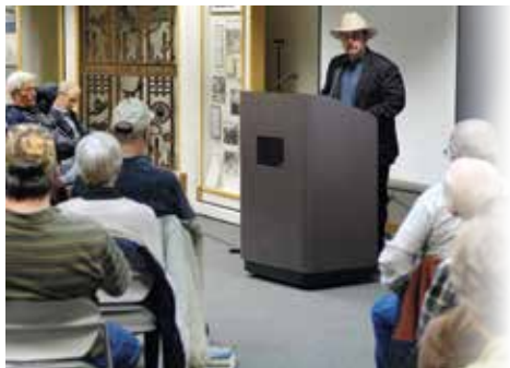
Wyoming native and nationally known mystery author, C. J. Box, giving a presentation and book signing at the AHC, 2011.

Fellowship supports use of AHC's collections by a recognized scholar in the history of economic geology or a related field.