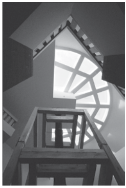
Looking up to fifth floor from the Mary Storer Loggia, American Heritage Center.