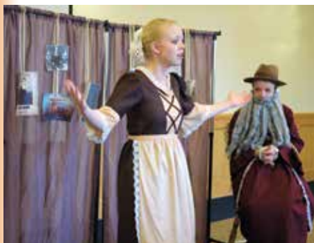
Wyoming History Day students' performance, 2011.

Wyoming History Day is the state affiliate of National History Day, the nation's premier history education enrichment