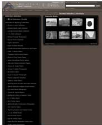
Digital Collections Web site, at http://digitalcollections.uwyo.edu/luna

The award-winning AHC Web site ( http://ahc.uwyo.edu ) receives over 60,000 visitors annually and contains information on its faculty, its policies, its public programs, its exhibits, its grants, its publications, and most importantly, its collections. The AHC has also provided national leadership in the area of digitization, including “mass digitization,” speeding the process of creating digital facsimiles from our collection material.