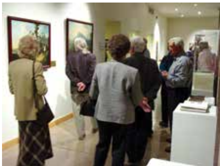
Visitors viewing Alfred Jacob Miller paintings in the Centennial Complex Loggia.

The AHC is not a museum, but the circumstances of its history have resulted in the premier collection of Western art at UW being on permanent display in the