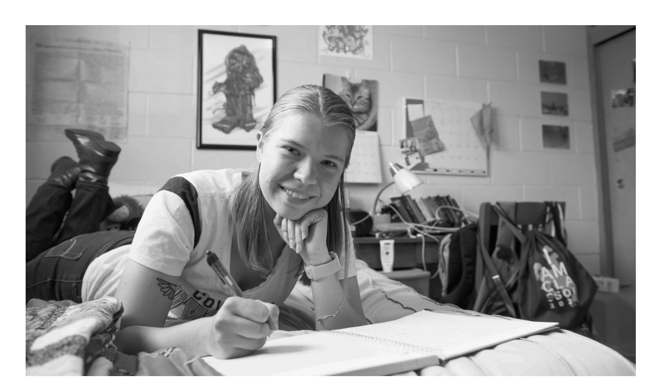
Open Communication: The Key to a Successful Roommate Relationship

Talk to your roommate. We can't stress this enough. Don't avoid conversations because you're afraid that they might be awkward. This doesn't mean you have to be best buds who share everything, but if your roommate does something inappropriate, you should let him know. If you let problems pile up without addressing them, the relationship will start to sour. Address issues as they come up, and you'll be able to defuse them more easily.