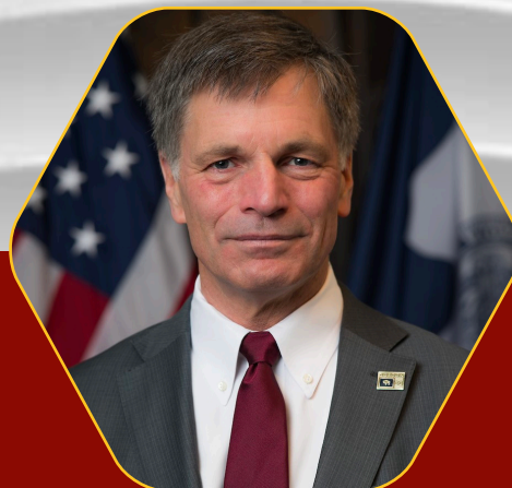
Mark Gordon Governor of Wyoming