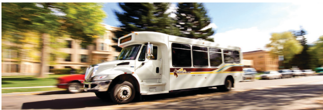
SafeRide shuttle.

SafeRide is a fare-free, on-call public transportation service that operates late nights on weekends within the Laramie city limits. Rides are offered to UW students, faculty, staff, and community members and visitors. Request rides by calling 307-766-7433 (307-766-RIDE) or with the Transloc Rider App.