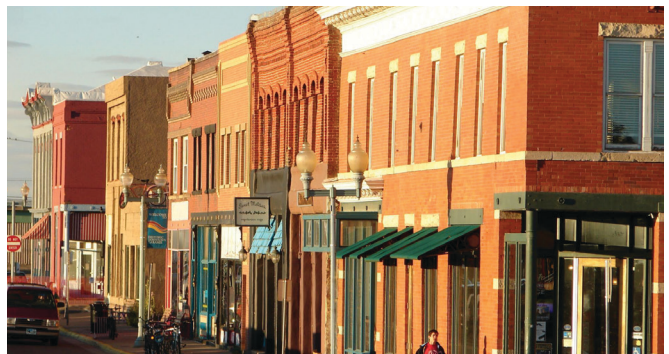
Downtown Laramie on First Street

Once a tent railroad town, Laramie gained international attention in 1870 when Louisa Swain became “the world's first woman voter under laws guaranteeing absolute political equality.” Today, Laramie today is bustling with technology, academia, industry, and agriculture, giving it a diverse mix of residents.