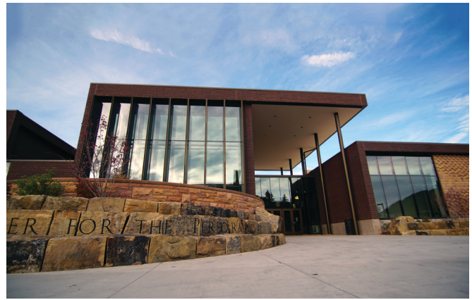
UW's Buchanan Center for the Performing Arts.

As the home of the only four year university in Wyoming, the University of Wyoming, as well as the Wyoming Technical Institute, the Albany Country branch of the Laramie County Community College, the American Heritage Center, the Wyoming Territorial Prison State Historic Site, and so much more, Laramie offers a wide range of sporting events and educational and cultural opportunities.