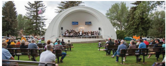
Washington Park Bandshell, summer concert series.

Laramie offers 11 museums, five art galleries, two golf courses, two movie theatres, 10 city parks, two soccer parks, a softball field complex, a recreation center with indoor and outdoor pools, and the Laramie Greenbelt. Food and lodging options in Laramie are diverse and eclectic.