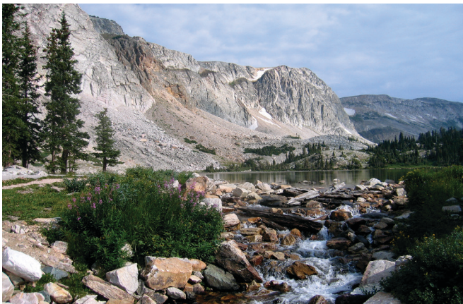
The Snowy Range mountains west of Laramie.

Also known as the “Gem City of the Plains,” Laramie sits at 7,200 ft above sea level, surrounded by the Snowy Range Mountains, the Vedauwoo Recreation Area, and the Medicine Bow National Forest, offering beautiful scenery with an abundance of outdoor activities, including fishing, camping, skiing, snowmobiling, hiking, biking, and climbing.