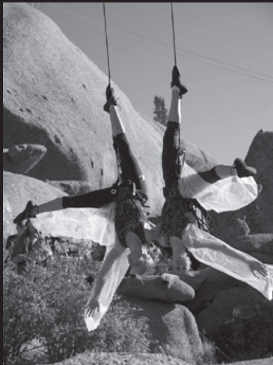
Dancers form a dragonfly at Vedauwoo.