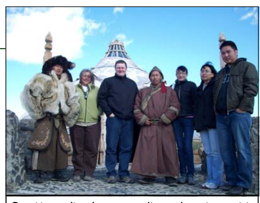
Our Mongolian hosts coordinated a trip to visit the Ancient Cities. We are standing in front of the Outpost City which was used as a first line of defense to protect the interior King's City and as a mail delivery center.

bassy has also provided grants to support the Mongolian 4-H Youth Organization, as well as lodging during our training.