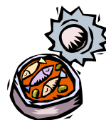
c) canned sardines with bones