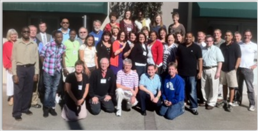
Last year's symposium attendees, having more fun than should be allowed

We are pleased to announce the opportunity to study the Agenda for Education in a Democracy (AED) again this summer in Seattle. The executive board is developing a new week-long summer symposium for those who have not had the opportunity to participate in year-long leadership programs or other NNER initiatives and who are interested in learning more about the Agenda and how to apply its principles in their work and the NNER mission. Activities and interaction will be developed using evaluation information from previous symposium participants. The symposium will provide opportunities to meet with colleagues from across the NNER, discuss issues pertinent to the health of our public schools, universities, and communities, and to study and interact with NNER leaders committed to advancing the AED.