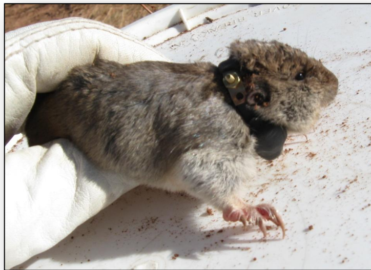
AVM Mini-BT Collar deployed on T. talpoides female, Oct. 14, 2010.

Spatial precision was very good with these collars. Using a 3-element Yagi antenna, collared animals could be detected from up to 300 meters away while in their burrows. By subsequently using the receiver without the antenna, the location of the gopher could be determined to within 20cm. Nevertheless, there are some significant setbacks in the deployment of these collars. The collar design is bulky and cumbersome and attachment involved an inordinate amount of fitting and adjusting leading to excessive stress on the animal. In addition, the transmitter hangs around the gopher's neck which may hamper gopher movement and feeding, including the use of cheek pouches.