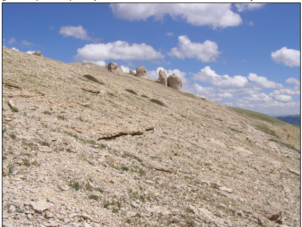
Figure 5. Physaria didymocarpa var. lanata habitat on Duncum Mountain.

In Wyoming, Physaria didymocarpa var. lanata occurs on shallow, stony soils of exposed limestone, sandstone or shale outcrops; and is typically found on ridges, rims, buttes, and knolls (Figure 5). Montana populations are sometimes found on clinker scoria, as well as the more typical shale, sandstone and calcareous substrates (Taylor and Caner 2002). Its elevation ranges from 1,080 to 3,100 m (3,540 to 10,160 ft) in Wyoming, and is as low as 1,000 m (3,300 ft) in Montana.