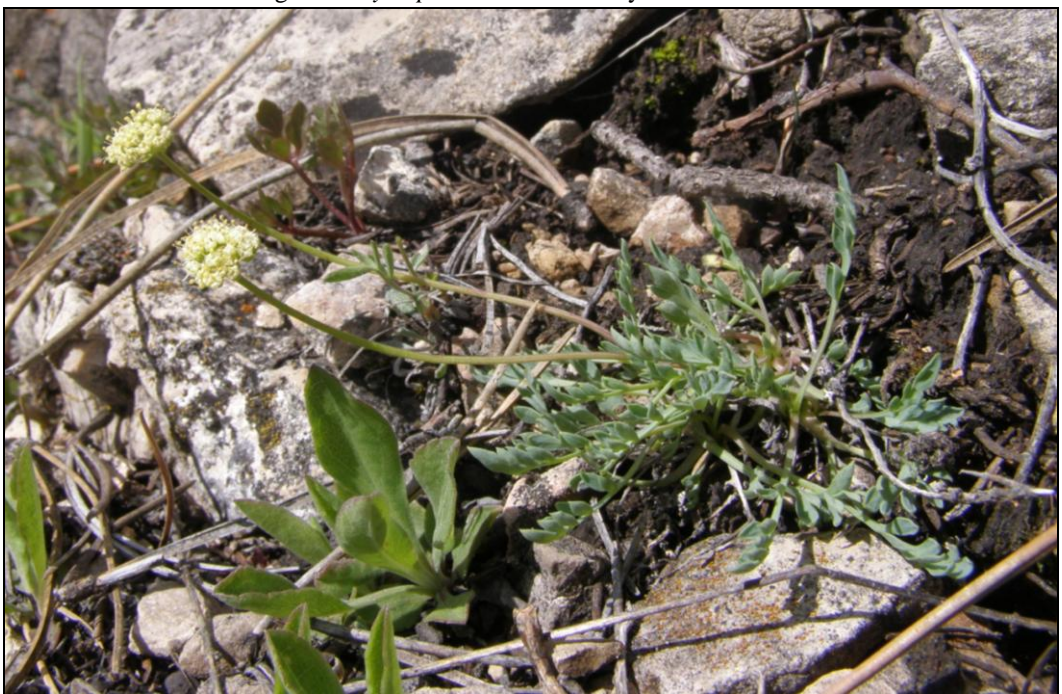
Figure 8. Cymopterus williamsii. By Bonnie Heidel.

<u>Associated species of concern</u>: Among rare plants, there is one Wyoming species of special concern that is sometimes found on the same slopes, Cymopterus williamsii (Williams' springparsley), at the south end of the Bighorn Mountains (Figure 8). There is partial overlap of Musineon vaginatum (sheathed musineon) and Physaria didymocarpa var. lanata in the Bighorn Mountains, in the same sections or townships, but few places, such as Dry Fork Ridge (#021), where they occupy the same habitat zones.