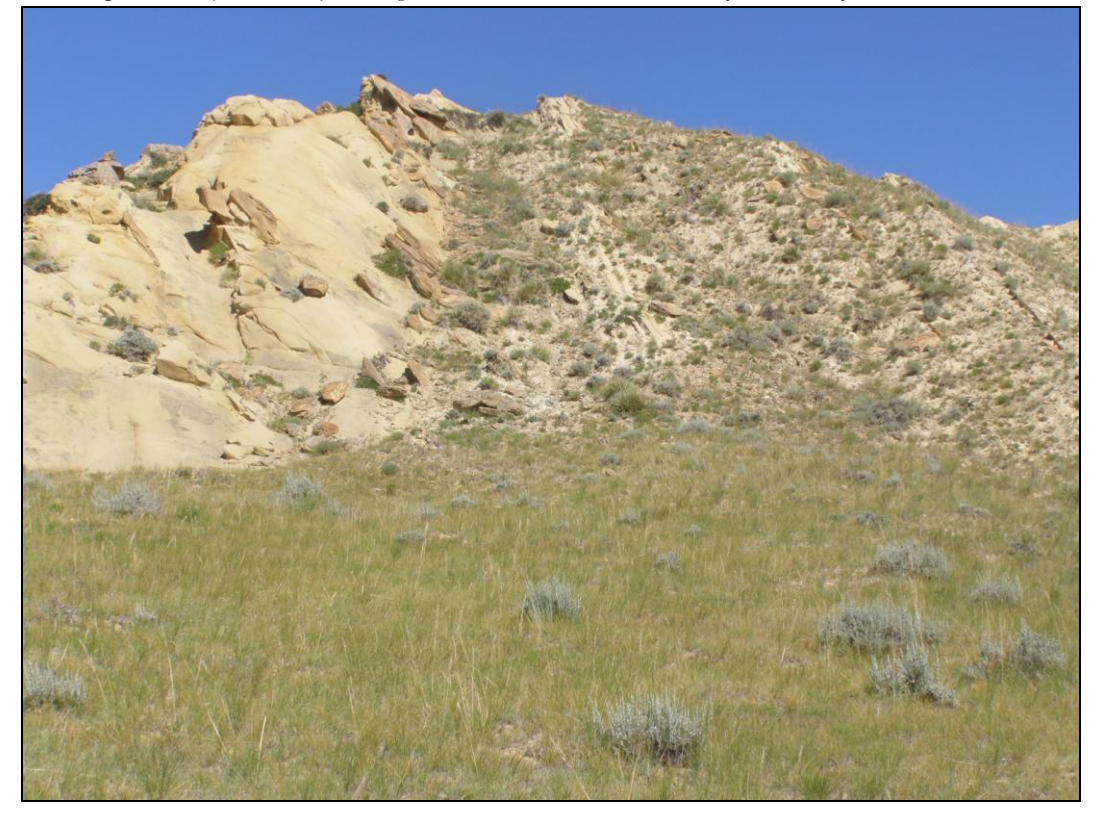
Figure 7. Physaria didymocarpa var. lanata habitat on Boyd Ridge. By Stephanie Zier.

Figure 6. Physaria didymocarpa var. lanata habitat at Muddy Creek. By Bonnie Heidel.