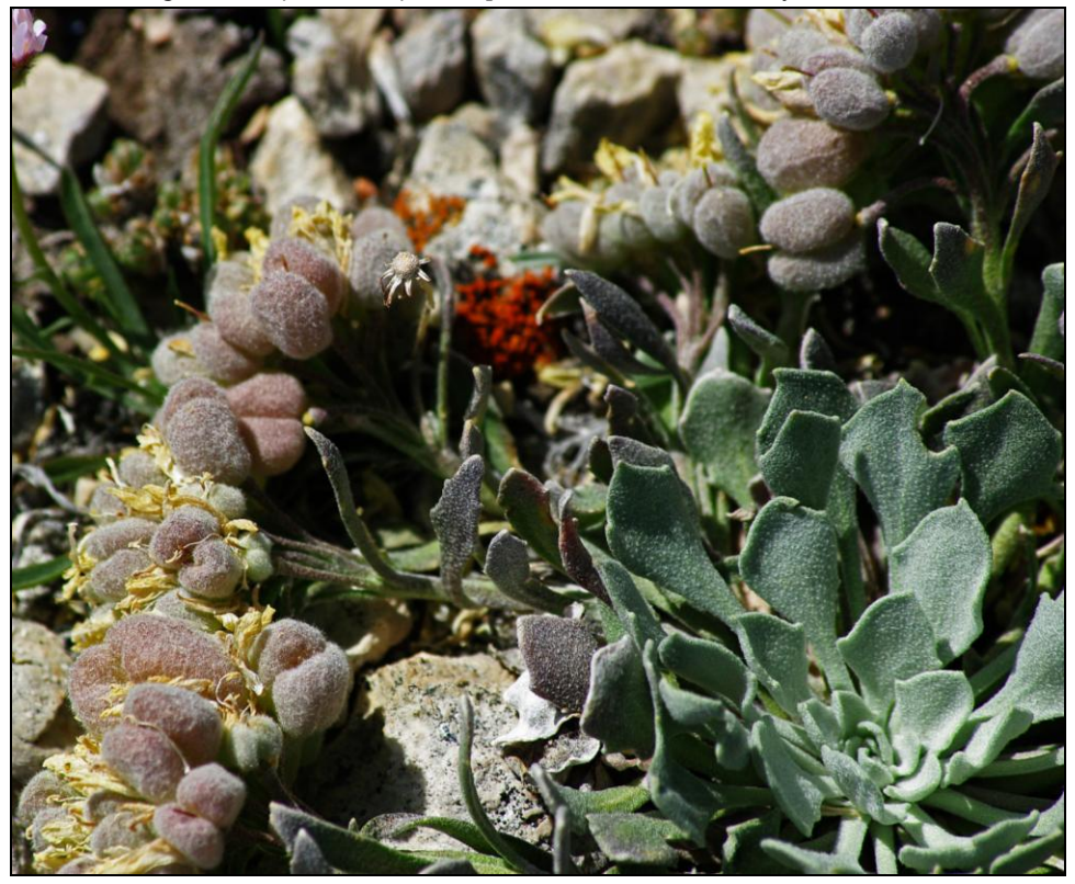
Figure 2. Physaria didymocarpa var. lanata in fruit. By Earl Jensen