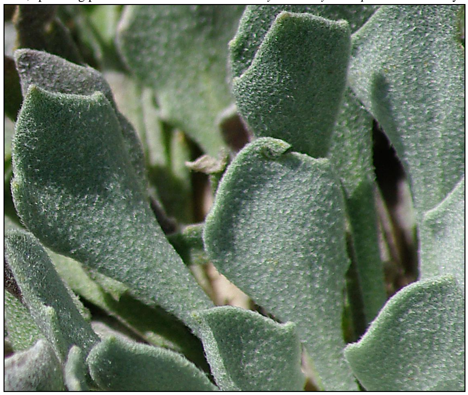
Figure 3. Loose, spreading pubescence on basal leaves of Physaria didymocarpa var. lanata . By Earl Jensen.