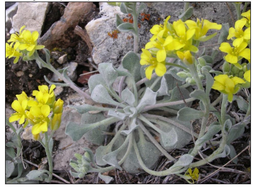
Figure 1. Physaria didymocarpa var. lanata in flower. By Bonnie Heidel.

1). Mature fruits consist of 2 inflated, balloon-like pods with shaggy pubescence (Figure 2). The replum of the mature fruit is narrowly lance-shaped to oblanceolate with 2 stubby funiculi per face (Dorn 2001; Rollins 1993, Fertig 2000).