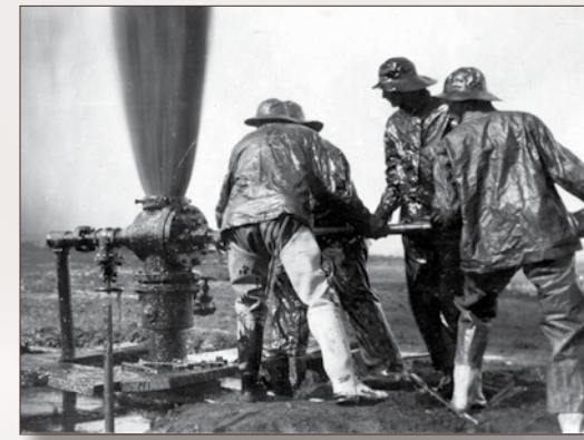
Workers capping an oil well.