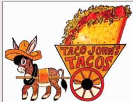
An early logo used by Taco John's International, Inc., 1976-1979. Taco John's International, Inc., Records.