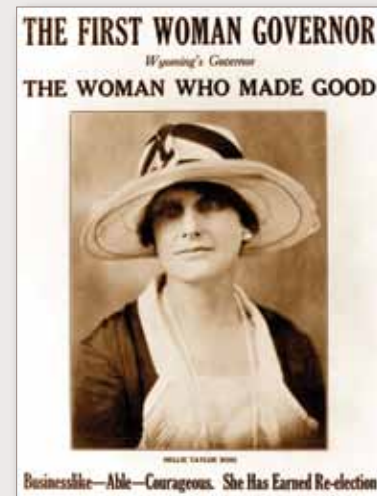
Reelection campaign poster for the first woman governor in the United States, Wyoming Governor Nellie Tayloe Ross, 1926. Nellie Tayloe Ross Papers.