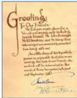
Autographed page from a book by John Burroughs, 1916.