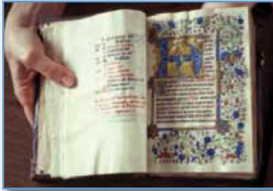
Illuminated Flemish prayer book from the 1400s.