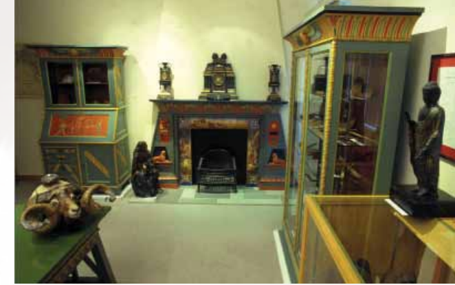
The Colket Room, adjacent to the Toppan Rare Books Library, American Heritage Center.