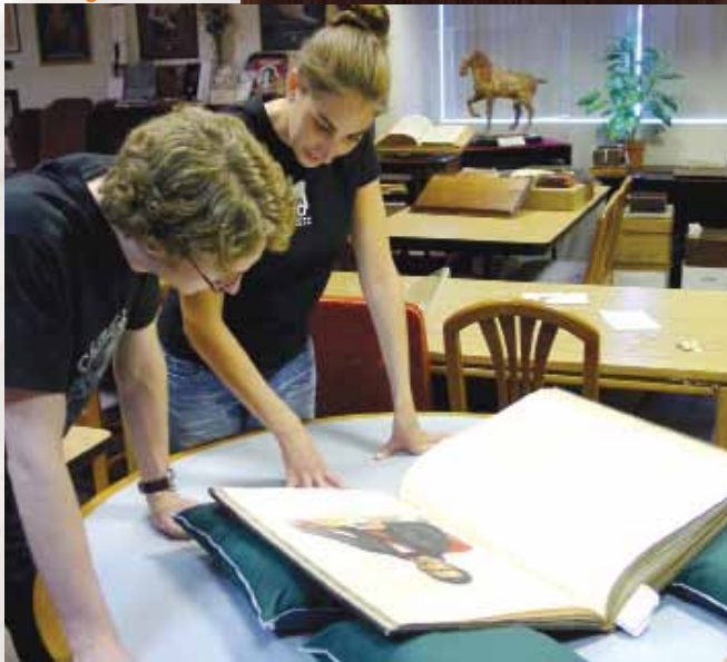
Students studying one of the books from the Toppan Rare Books Library, American Heritage Center.