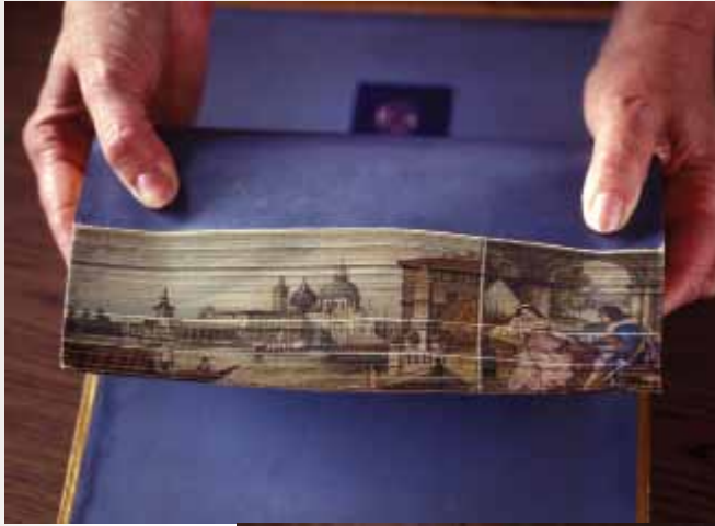
Fore-edge painting on a book by Lord Byron, 1821.