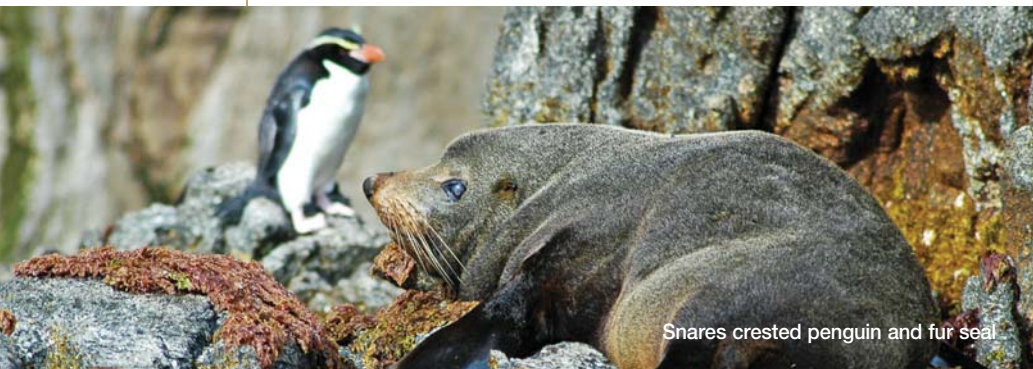
Snares crested penguin and fur seal

Oceania Cruises may modify the cruise itinerary up to and during the voyage. Air arrangements, cruise accommodations, local transportation, and optional shore excursions are arranged by Oceania Cruises, which may use other suppliers or providers to render the services. The agreement in this brochure is the exclusive and entire statement of the agreement between you and Go Next Inc. It should be read carefully.