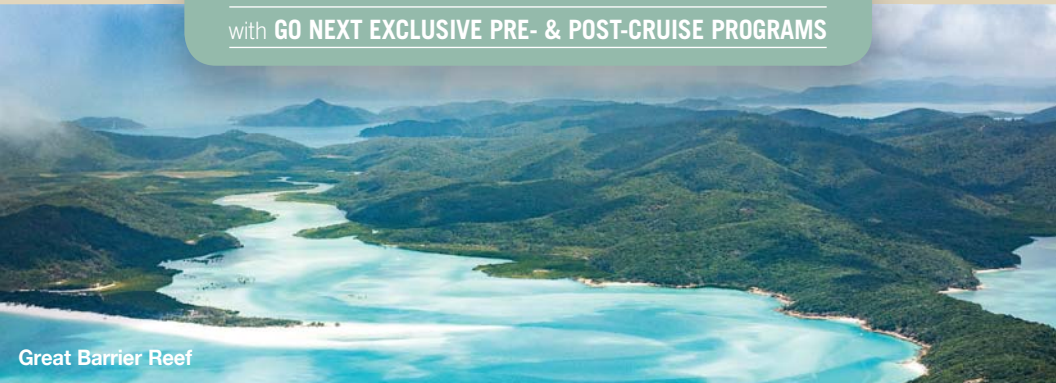
Great Barrier Reef

with GO NEXT EXCLUSIVE PRE- & POST-CRUISE PROGRAMS