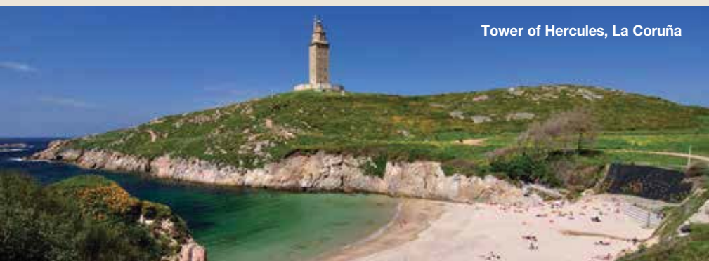
Tower of Hercules, La Coruña

All stateroom/suite locations and prices are subject to availability. Deposit and cancellation policies for categories OS and VS differ from those listed in this brochure. Please call for details.