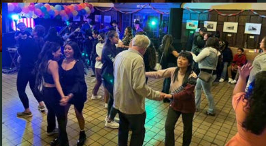
HISPANIC HERITAGE MONTH EVENT CELEBRATION (OCT 5) - LARAMIE RAILROAD DEPOT, 600 S 1ST STREET PUT TOGETHER BY: AMERICAN STUDIES (AMST) / MULTICULTURAL AFFAIRS (MA) / LATINA/O STUDIES & THE SCHOOL OF CULTURE, GENDER, AND SOCIAL JUSTICE (SCGSJ).