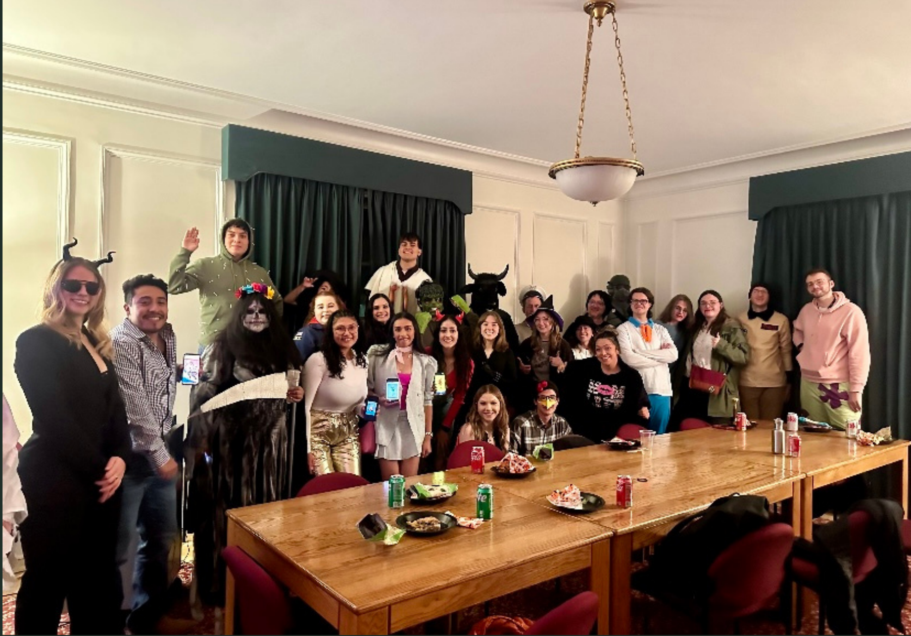
THE COOPER HOUSE HALLOWEEN COSTUME PARTY (OCT 31) WHICH FEATURED A SCREENING OF THE 1999 HORROR FILM "RAVENOUS".