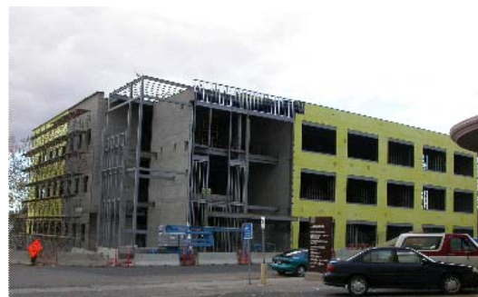
New Anthropology building, future home of the Frison Institute, under construction