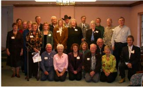
Board of the Friends of the Frison Institute at the September meeting

The Board discussed a range of issues including: 1) continued fundraising for the growth of the newly established Frison Institute Endowment; 2) continued development of promotional material, namely Institute pins for donors, volunteers, and friends; and 3) acquisition of major equipment for the Institute, namely tractor/backhoe, vehicles, and trailers.