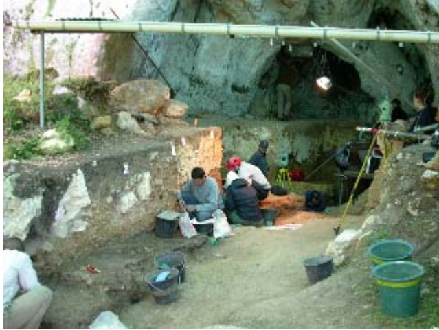
2006 excavation at Roc de Marsal