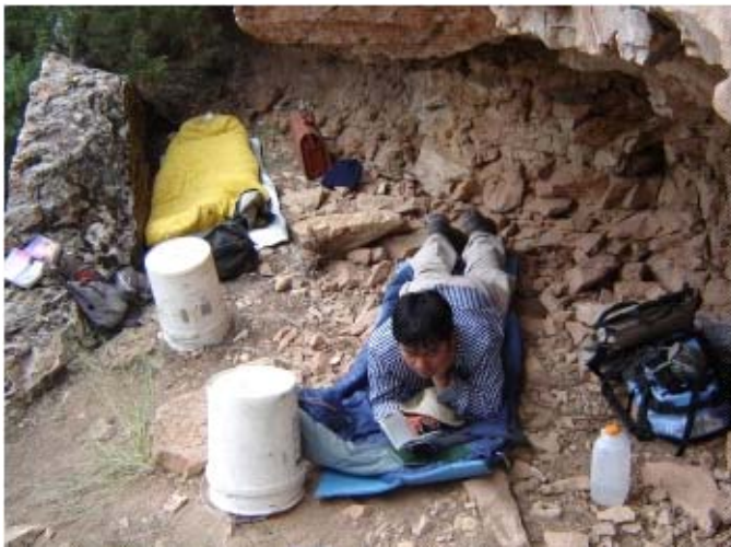
Jun Hashizume in one of the tested shelters