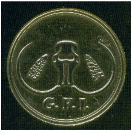
New gold color pins of the Board of the Friends of the Frison Institute