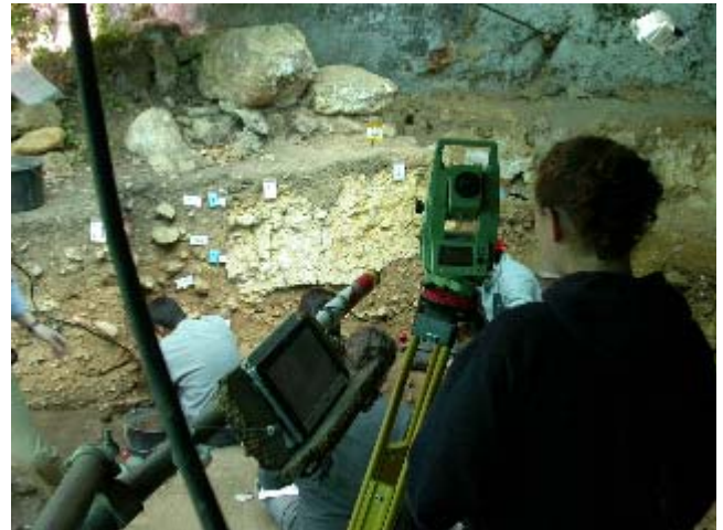
EDMwin in use at Roc de Marsal

artifacts and other samples are recovered. It is through use of the ENE4 system that such fine techniques are possible. The new system virtually eliminates the need for writing field forms and drawing maps, as all of this is automated. Both maps and data tables may be viewed immediately on the field laptop after the laser transit takes a measurement. The ENE4 system was put to its first test in the Rocky Mountains during Institute excavations in August at Black Mountain and will be used in excavations at Hell Gap next May and June.