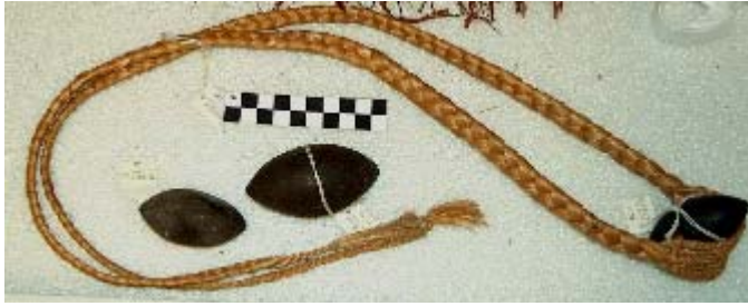
Sling and slingstones

We have much more to disclose, and hopefully we will in a major publication that if all goes well we'll have out in another year, well maybe two years. Meanwhile, we continue to excavate libraries, museum, and private collections for hidden gems of sling knowledge.