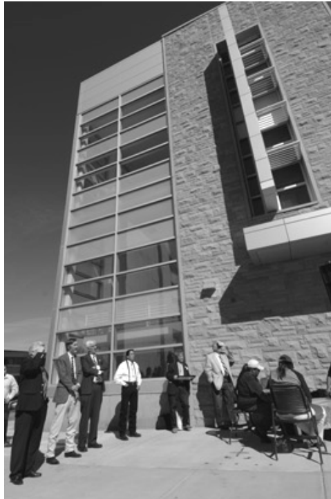
Ribbon cutters enjoy the music of the Wind River Singers while waiting for the festivities to begin.