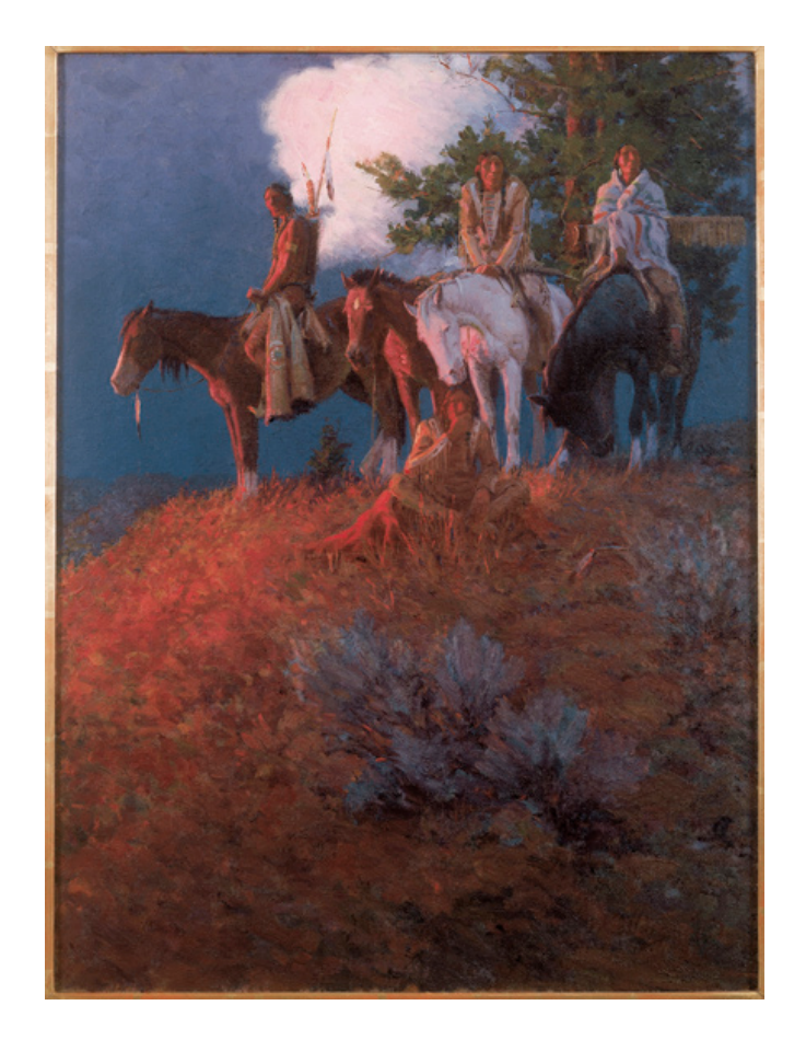
Indian Sunset , 1926, oil on canvas, 23-1/2 x 17-3/4 inches, University of Wyoming Art Museum, Sherry Nicholas Collection, no. 26