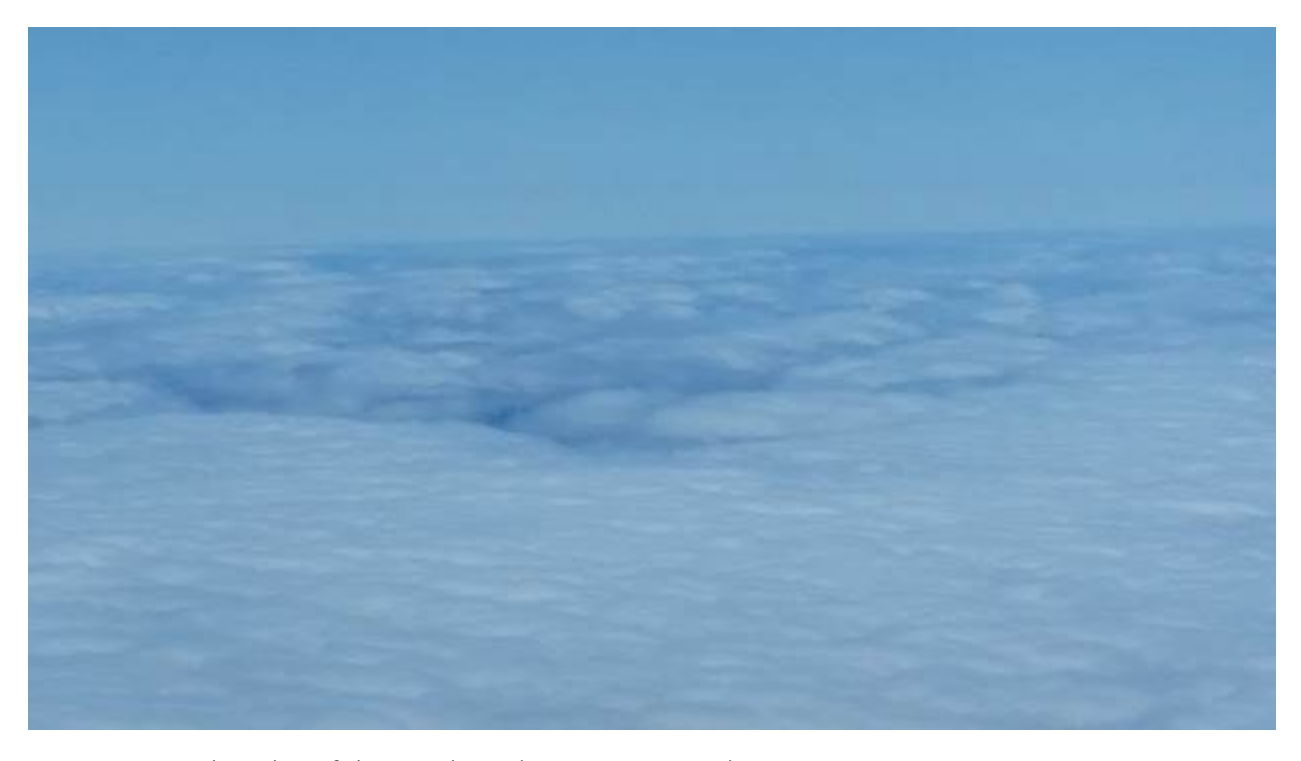
1718 Over the edge of the BKN layer (N41 20 W126 12)