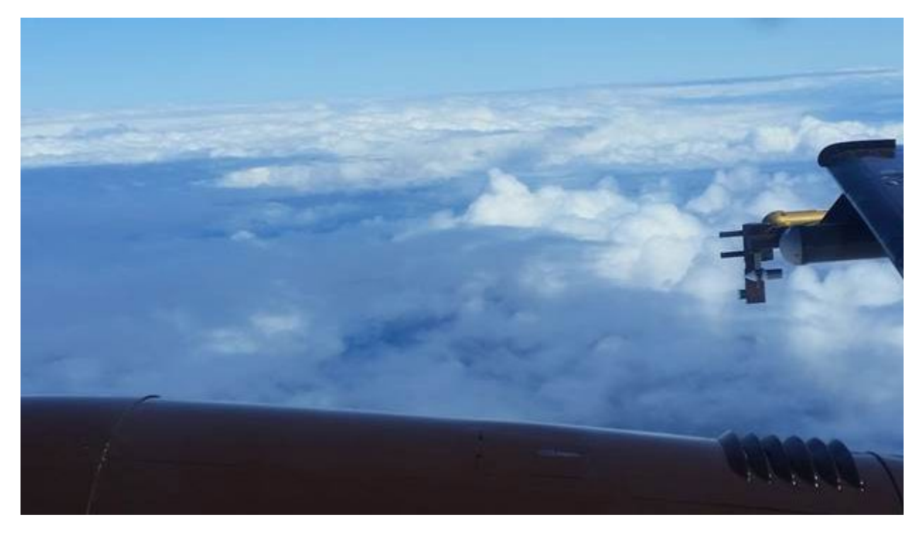
At point N40 30 W128 00 FL063. Turn to north and descend to FL055. Over solid layer 1756