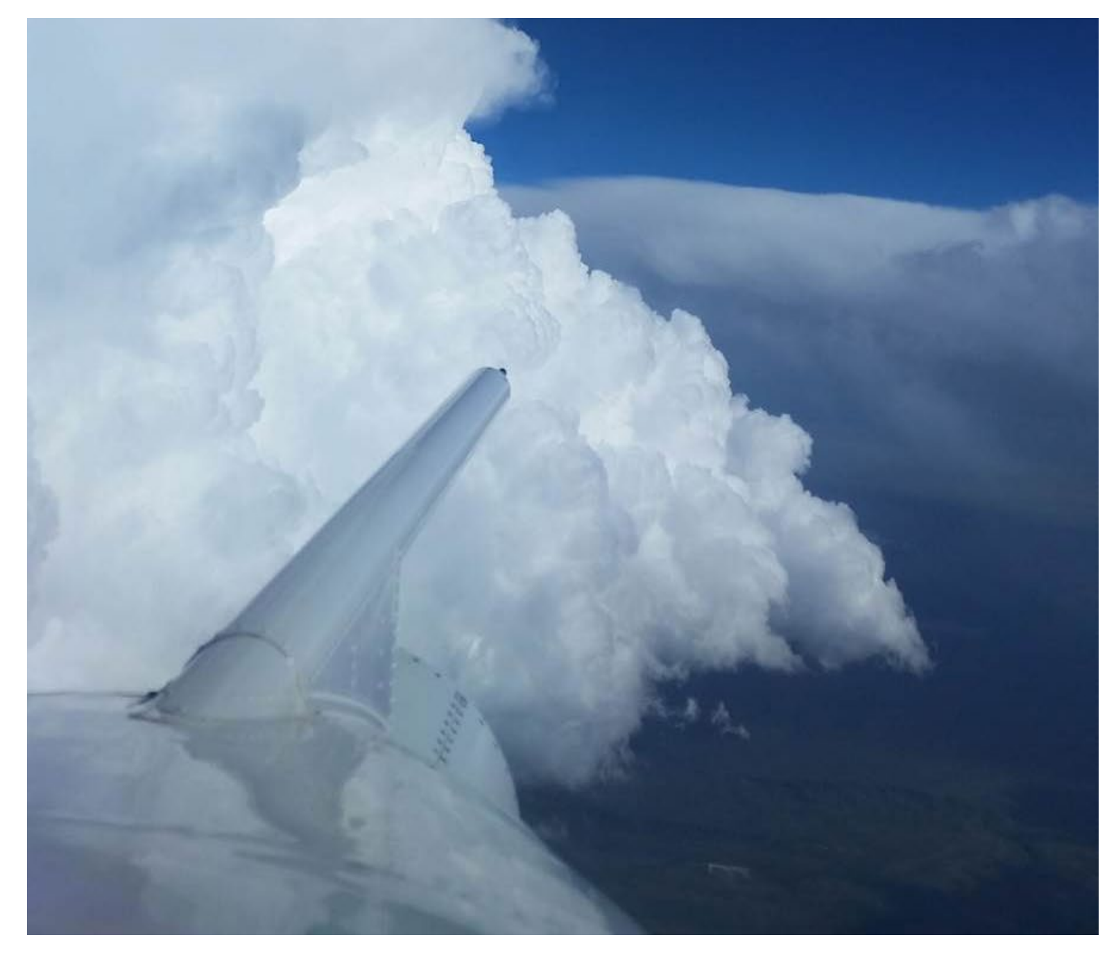
2400 Head home