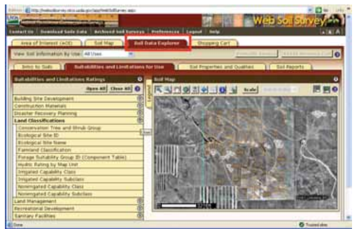
Step 2b. View soil data explorer