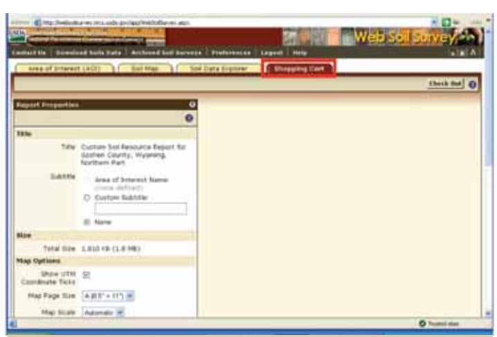
Step 3. Check out