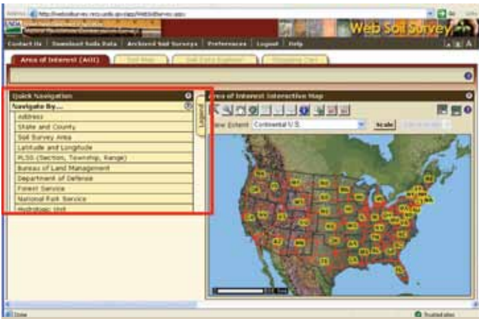
Step 1a. Find your location

Use the zoom tools to get closer to your desired area. Once there, use the AOI button to define your area of interest. The maximum size for an area is 10,000 acres. If you get a message regarding this, please redraw a smaller square.