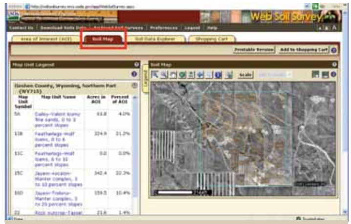
Step 2a. View soil map