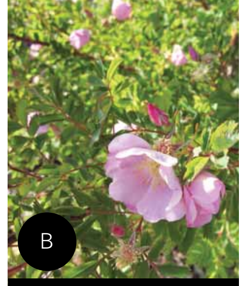
This shrub is most often seen in wet areas, although it is a common pioneer on disturbed sites. It has fragrant, pink flowers and bears a fleshy, red fruit.