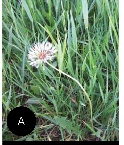
This common plant produces abundant seeds, which are easily transported by wind. Its leaves can even be used as salad greens.