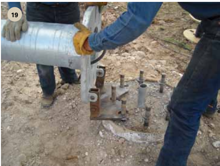
The tower hinge is positioned to the anchor bolts.