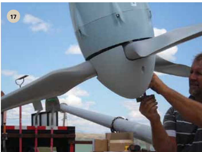
17 Blades are affixed to the head and fastened to the nose cone.