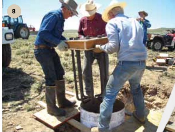
8 Placing the tower anchor bolts and jig in the tube.