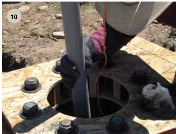
10 The electrical conduit and ground wire is rigged. The electrical wire will be buried in conduit in the trench, enter the concrete anchor, and exit the top of the anchor in the center of the tower.