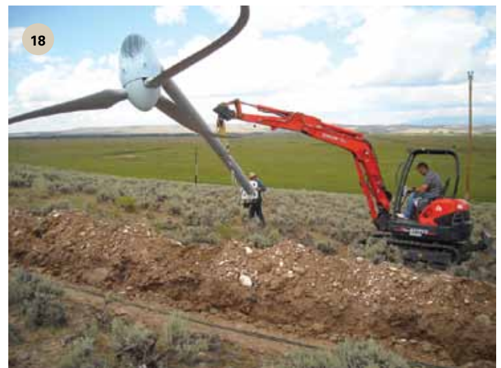
18 The unit is assembled and marched up the hill to the site.