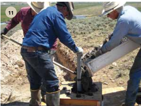
11 Completing the concrete pour, which fills the 12-foot tube and secures the anchor bolts.