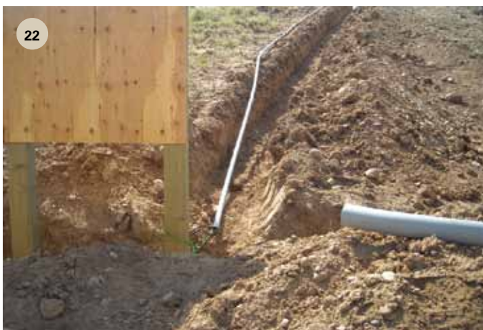
Wire-in conduit all the way from tower to the power board, and the trench is ready for backfilling.