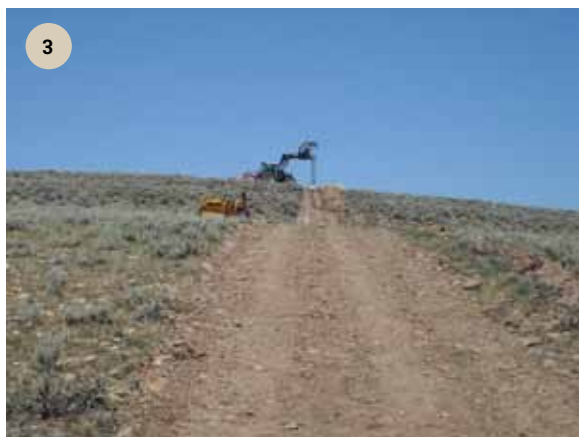
The rebar cage is dropped into the hole.