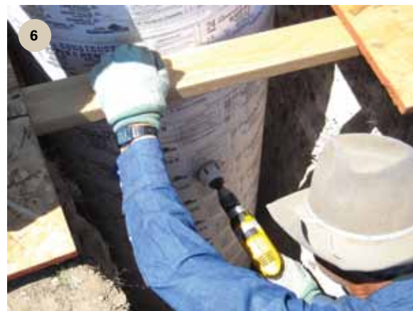
An access hole is drilled for the electrical conduit.