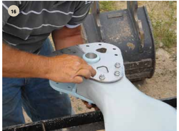
16 The blade units are assembled.