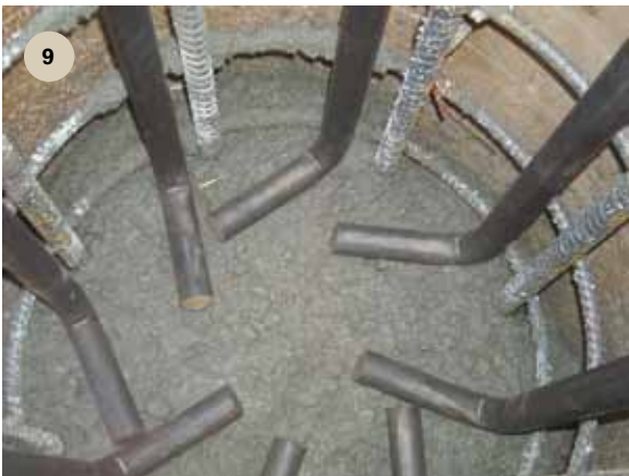
9 Here is a view inside the tube ready for the final concrete pour.