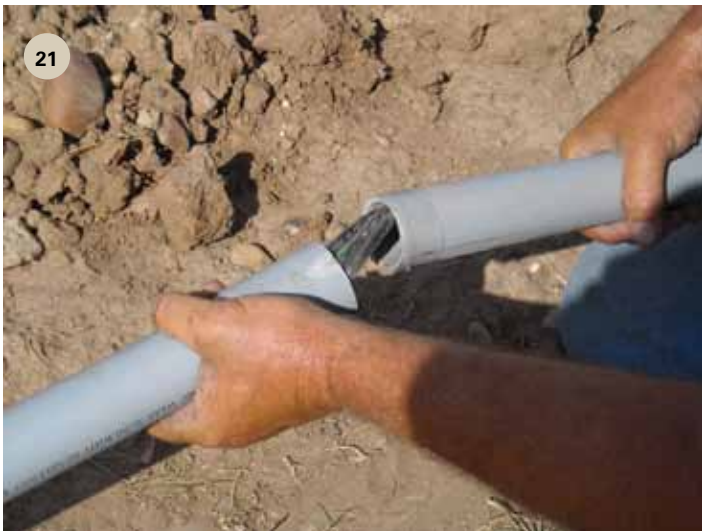
String the wires through the conduit and glue the joints together.