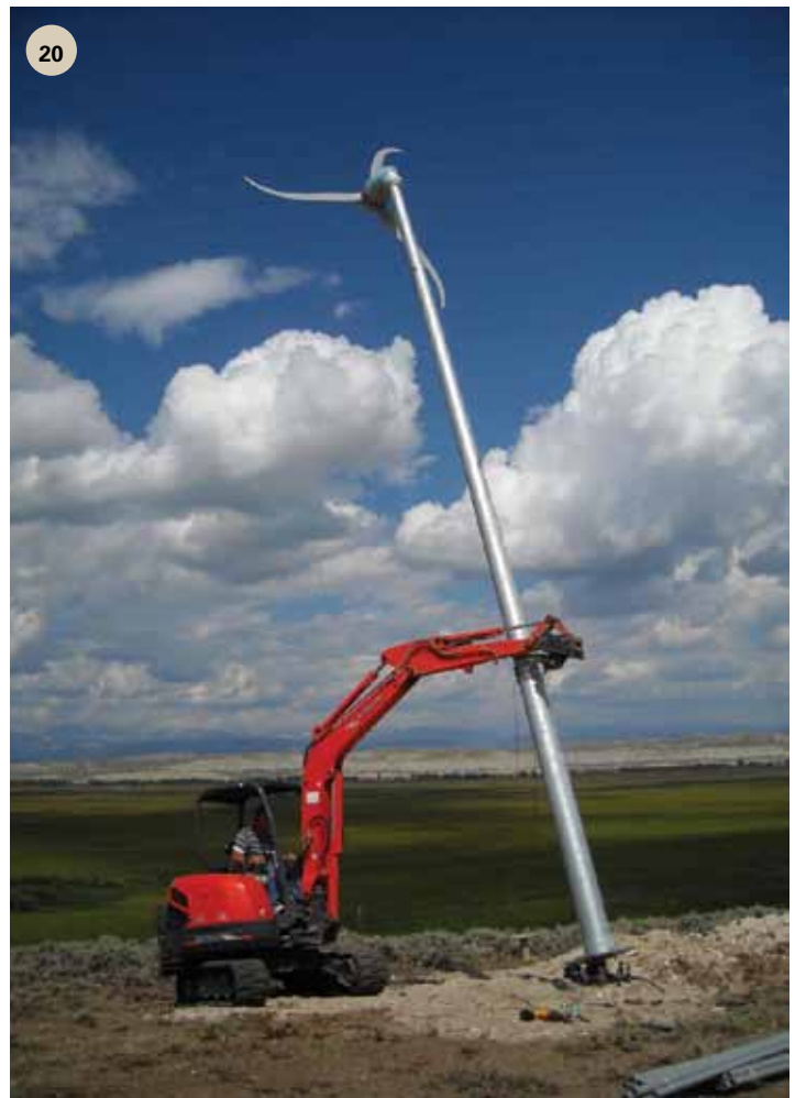
With the hinge securely fastened, up she goes!