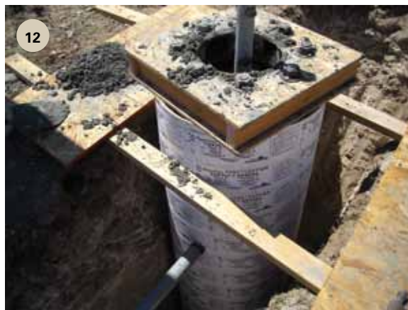
12 Just leave the cement to set! Notice the entry and exit points for the electrical conduit.