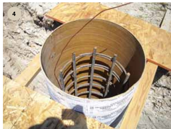
This shows the rebar cage fixed in position inside the tube. The tube is anchored vertically in the hole and ready for cement.