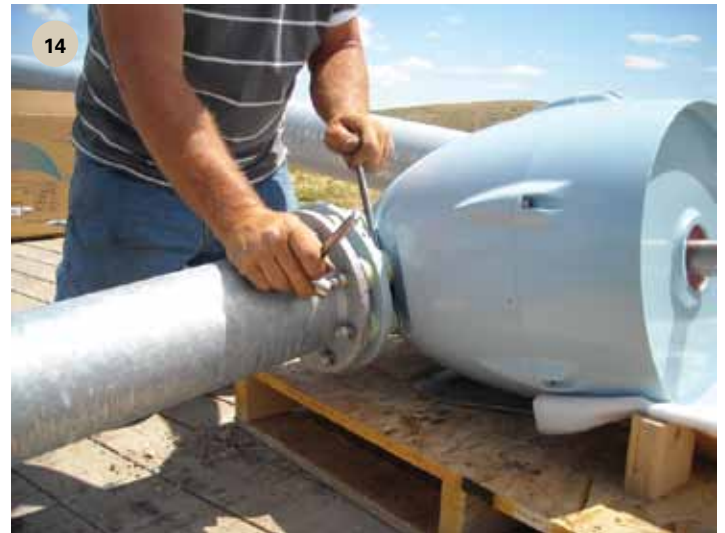
14 The turbine and tower arrived on a flatbed trailer a day after the concrete anchor had hardened. Here, the technician from the turbine dealership fastens the head to the tower.