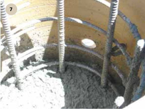
7 A view inside the tube and awaiting anchor bolts and conduit.