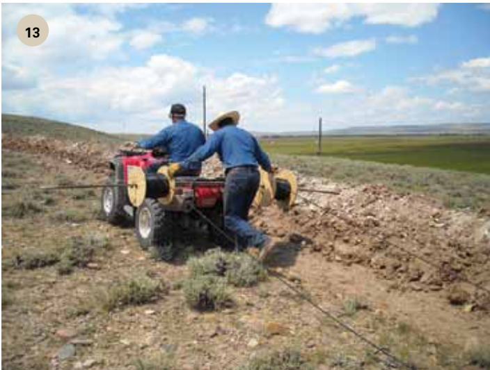
13 The wire is strung from tower to power panel. Dig the trench deep enough to afford protection, but remember, "Call before you dig!" The number is 811.