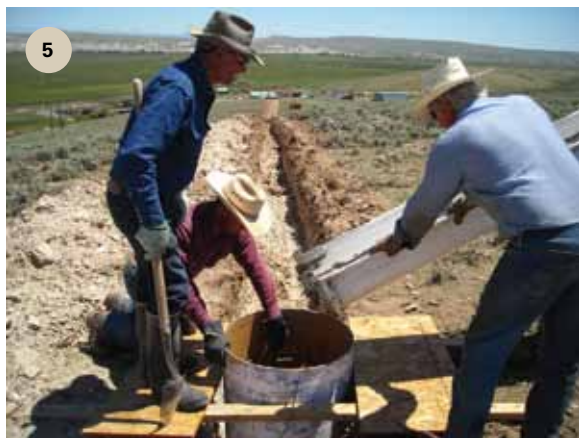
The first 9 feet of cement is poured in the 12-foot anchor column.