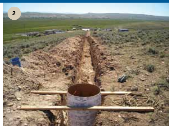
Shown are the hole with tube and the trench leading to the buildings. This hilltop is about 200 yards from the ranch.