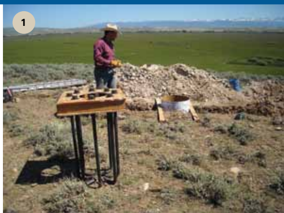
Notice the stunning hilltop views from all directions. You can bet that, if there is any wind, this location can take advantage. Notice the very top of the 12-foot long concrete tube and, in the foreground, the jig holding the anchor bolts in position.

A large turbine has to be very well-anchored. In this instance, a 20-inch diameter tube 12 feet deep was filled with rebar and a yard of cement for anchorage.