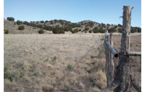
2. Good grazing management promotes more forage, fewer weeds, and less bare ground.

consumers. In most season-long grazing situations, harvest by domestic livestock is only about 25 to 35 percent. Therefore, when we are developing our grazing management plan, losses by other animals need to be accounted for to maintain plant health and vigor.