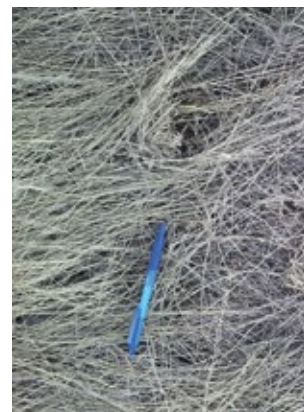
Litter (or dead plant tissue) that has accumulated due to a lack of grazing or other disturbances.

Many of Wyoming's landscapes have evolved with grazing, beginning with bison roaming the plains. This has allowed our native grass species to adapt and flourish with grazing. There is a catch: now that we have fences everywhere, it is our responsibility as landowners to control grazing, due to our animals being unable to migrate naturally. As much as we need to control grazing so as to not overgraze plants, it can also be detrimental to have no grazing. This is because of the lack of stimulation to the grasses. In the absence of grazing, plants often become less healthy and productive. A heavy layer of litter (dead plant material) can prevent or block new emerging vegetation from getting needed sunlight and the nutrients to grow.