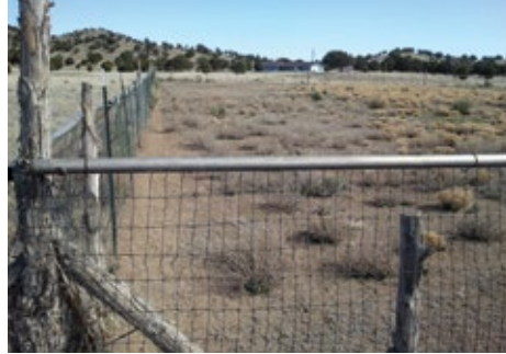
1. Continuous grazing allows weeds to grow where healthy desirable plants grew before but have been weakened and outcompeted.

Although we often do not see more than our livestock grazing our pastures on a regular basis, we cannot assume that livestock are the only ones consuming forage. There are numerous other consumers taking advantage of the growing plants in our pastures. Large wildlife like deer, antelope, and elk and much smaller creatures such as gophers and grasshoppers all consume forage. Research has shown that, on a majority of pastures, 15 to 25 percent of forage is eaten by these types of