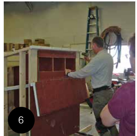
6 Install nesting boxes.