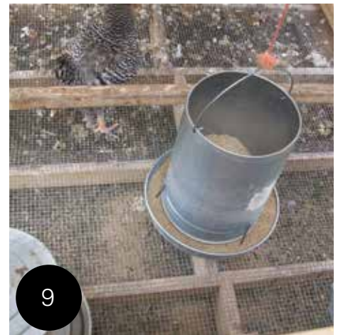
9 Add food and water.