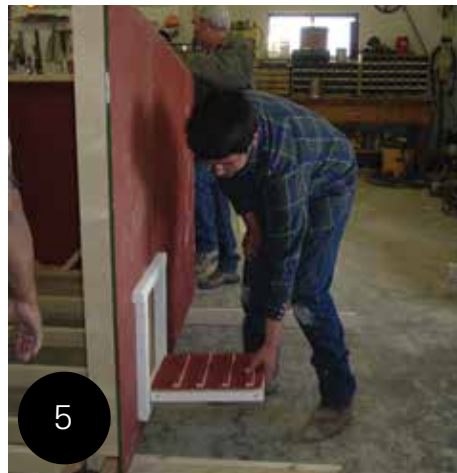
5 Attach the plywood wall to the wall frames. Complete access doors.