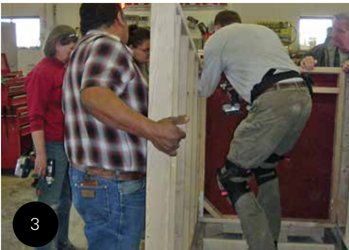
Complete the frames for end and side walls. Set walls in place. Attach walls to floor.