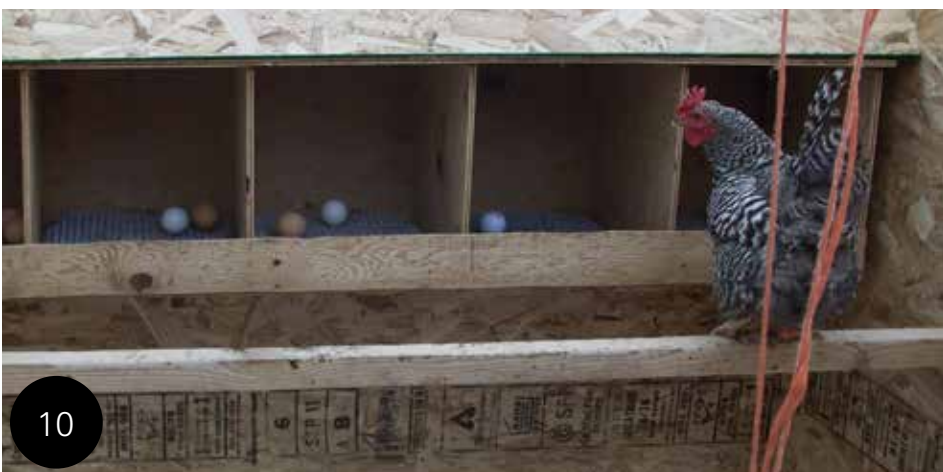
10 Check fence (is it electrified?). Add birds.

This structure will cost approximately $500 for materials. An electric fence charger will be about $200. The electric mesh poultry fence is also about $200 (retailers can be located by typing "electric mesh poultry fence" into a Web browser). Other accessories, such as a feeder and waterer, will be another $100. Visit barnyardsandbackyards.com for the complete plan and materials list.