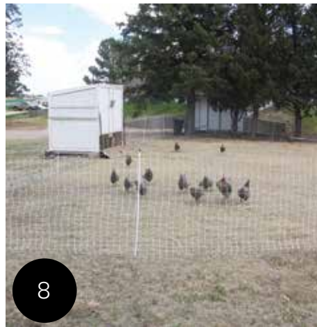
8 Set up electrified mesh fence.