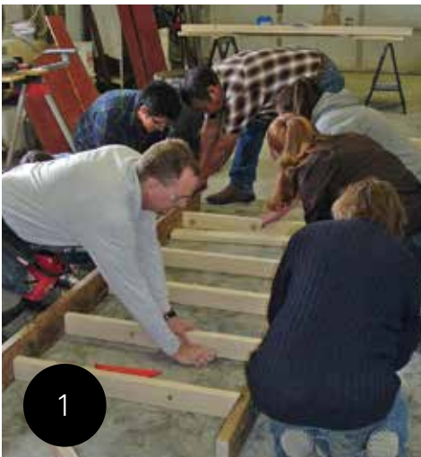
Build the frame for the base. Start upside down on a flat surface.