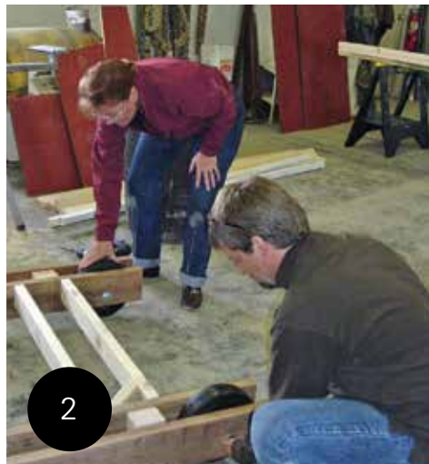
Turn base right side up and add the wheels. Cut to fit and attach the mesh screen to the base.