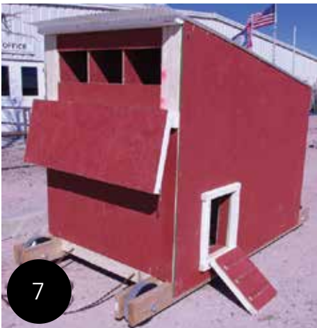
7 Attach roof material. Add pull rope. Set in place.