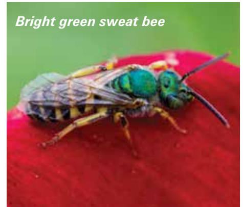
Bright green sweat bee

Mason and leafcutter bees are medium-sized, bulky insects that are solitary. Mason bees are generally a deep metallic blue, and leafcutter bees are usually black with pale hair. Most bees collect pollen on their legs, but mason and leafcutter bees collect pollen on dense hairs on their belly. Mason and leafcutter bees nest in cavities, which means they build nests above ground in small openings. Their common names refer to the structure of their nests. Mason bees build nests using mud or clay, and leafcutter bees line the walls of their nests with pieces of leaves. Leafcutter bees can be particular