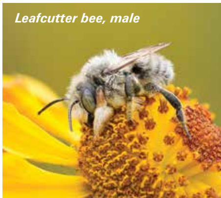
Leafcutter bee, male

example, blue orchard bees are used to pollinate almonds, cherries, and apples, and blueberry bees are used to pollinate blueberries.