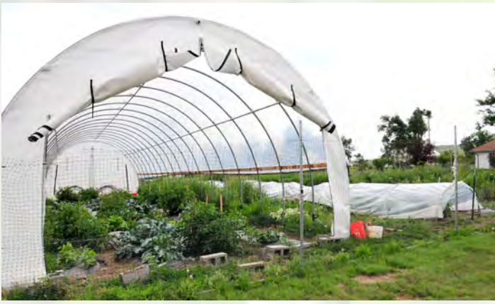
Season extension examples—high tunnel, left, and a low row cover, right.