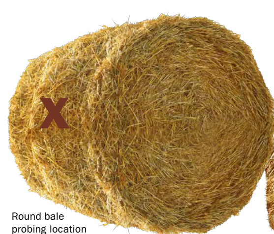
Fig. 1 – Hay probe sampling locations.

When livestock are going through the reproduction cycle (gestation or lactation stages) their