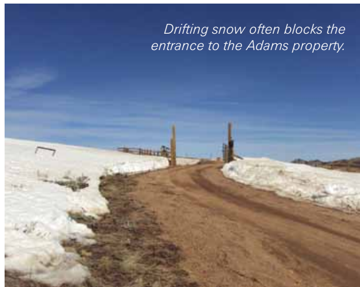
Drifting snow often blocks the entrance to the Adams property.