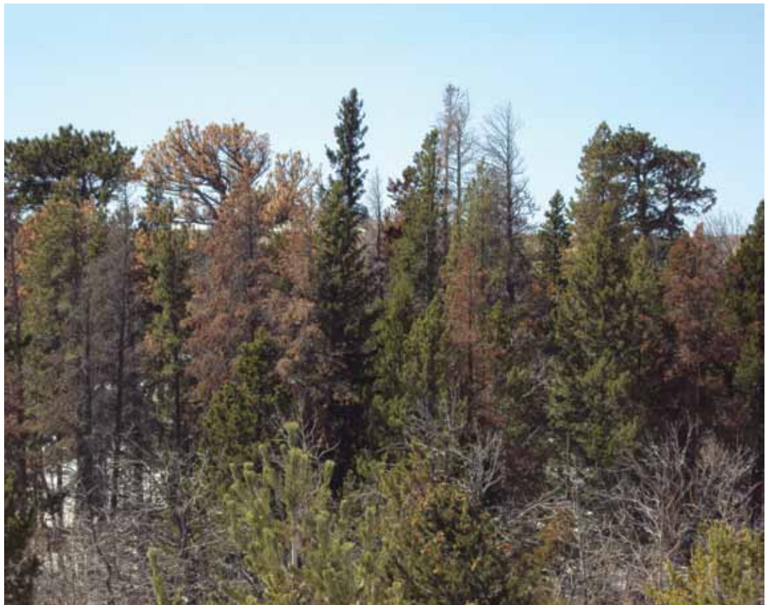
Mountain pine beetles have taken their toll on the property over the past two years.

Spraying all of the trees on the property is cost prohibitive, and the Adams are very concerned about continued loss of the large pines.