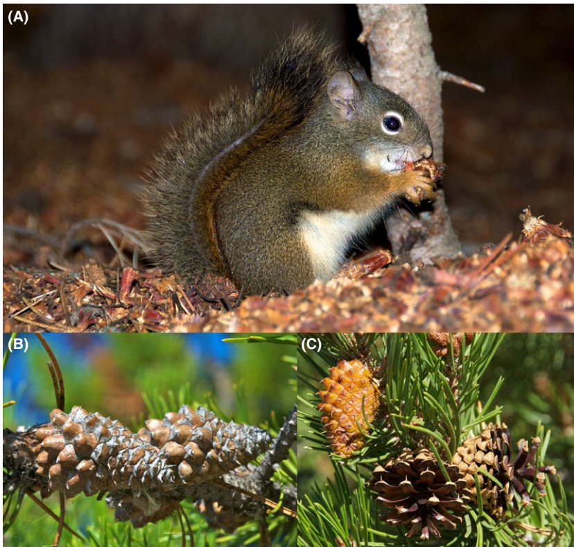
FIGURE 1 (A) A red squirrel ( Tamiasciurus hudsonicus ) eating a seed from a lodgepole pine ( Pinus contorta ssp. latifolia ) cone; only a few scales remain on the cone (on the distal end, directed downward). (B) Serotinous cones, which can remain closed for several decades unless removed by red squirrels or opened from heat of a fire. (C) Nonserotinous cones open in early autumn several weeks after the seeds mature; leftmost cone opened within weeks after photograph was taken.

Prior research shows that red squirrels (Fig. 1) select against serotiny by differentially preying on seeds in serotinous lodgepole pine cones, thereby depleting the arboreal seed bank (Talluto & Benkman, 2014). Moreover, cone serotiny is polygenic and heritable (Fig. 1B, C; Parchman et al., 2012) and thus should respond to selection. When red squirrel densities exceed one and half per hectare, past modeling suggests that selection by squirrels against serotiny overwhelms the selective pressure from fire favoring serotiny in Yellowstone (Talluto & Benkman, 2014). At lower squirrel densities, the balance between selection by fire and squirrels sets the frequency of serotiny (Talluto & Benkman, 2013, 2014); variation in the relative intensities of selection